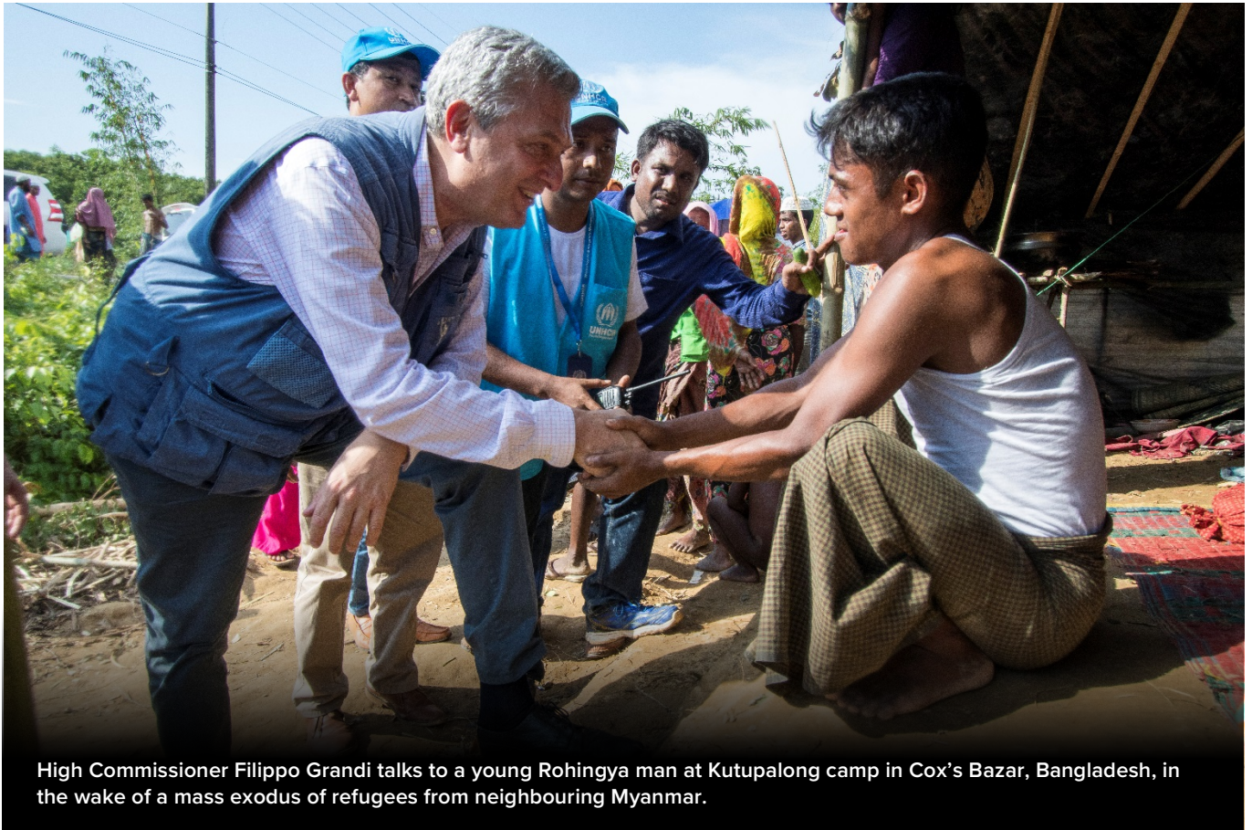
High Commissioner Filippo Grandi talks to a young Rohingya man at Kutupalong camp in Cox's Bazar, Bangladesh, in the wake of a mass exodus of refugees from neighbouring Myanmar.