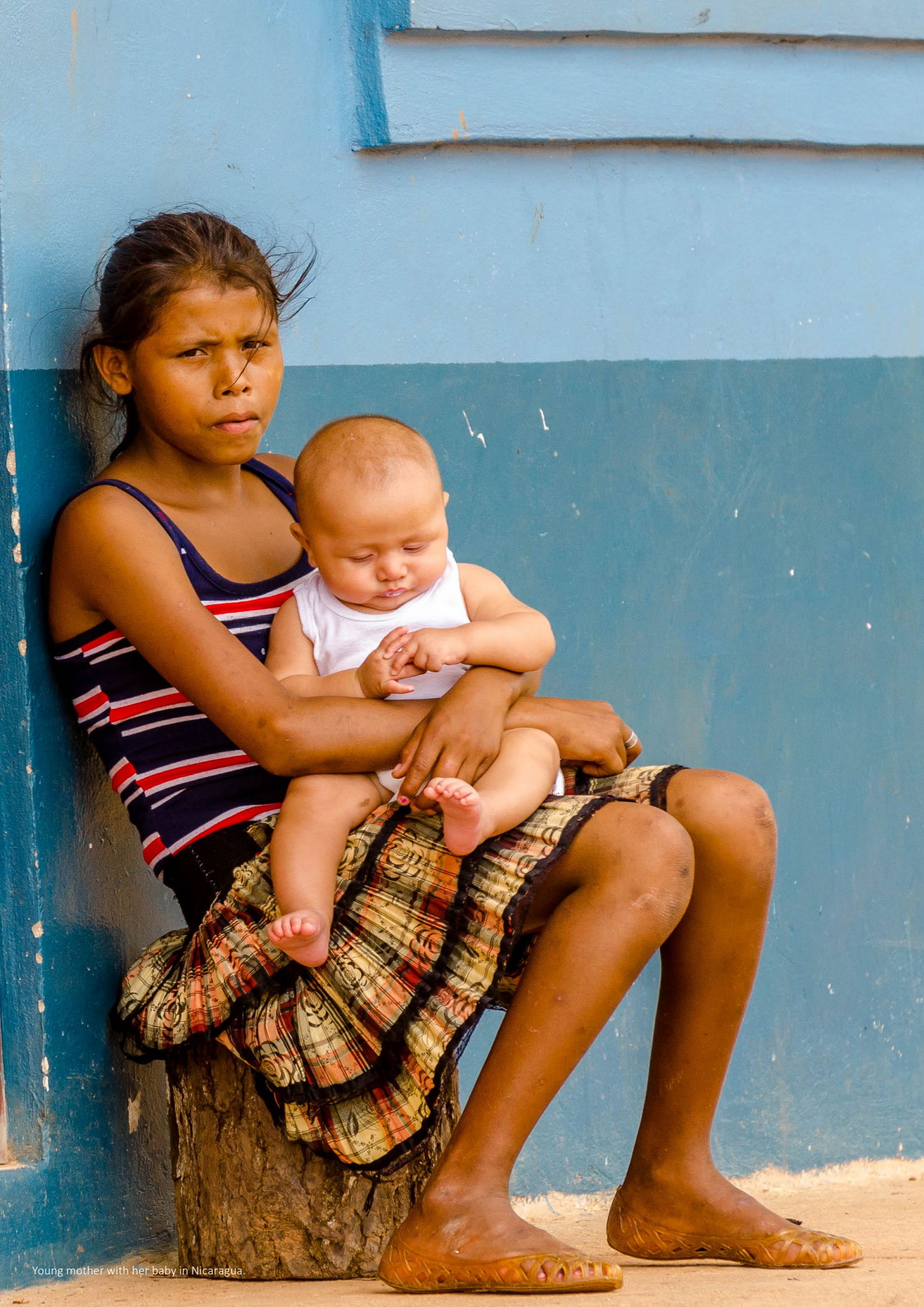
Young mother with her baby in Nicaragua.