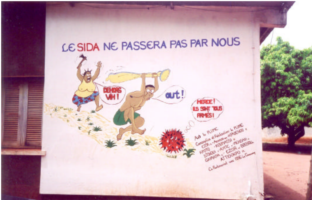
An AIDS education mural painted in partnership with a local NGO. Children trafficked into hazardous labor may be vulnerable to HIV infection.