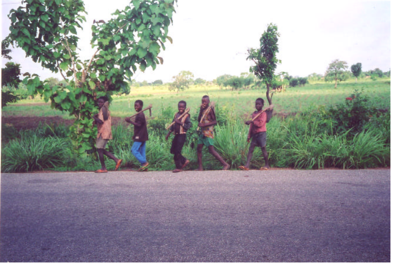
A group of Togolese boys carrying their tools to work. Trafficked children are often forced to use dangerous equipment such as saws and machetes.