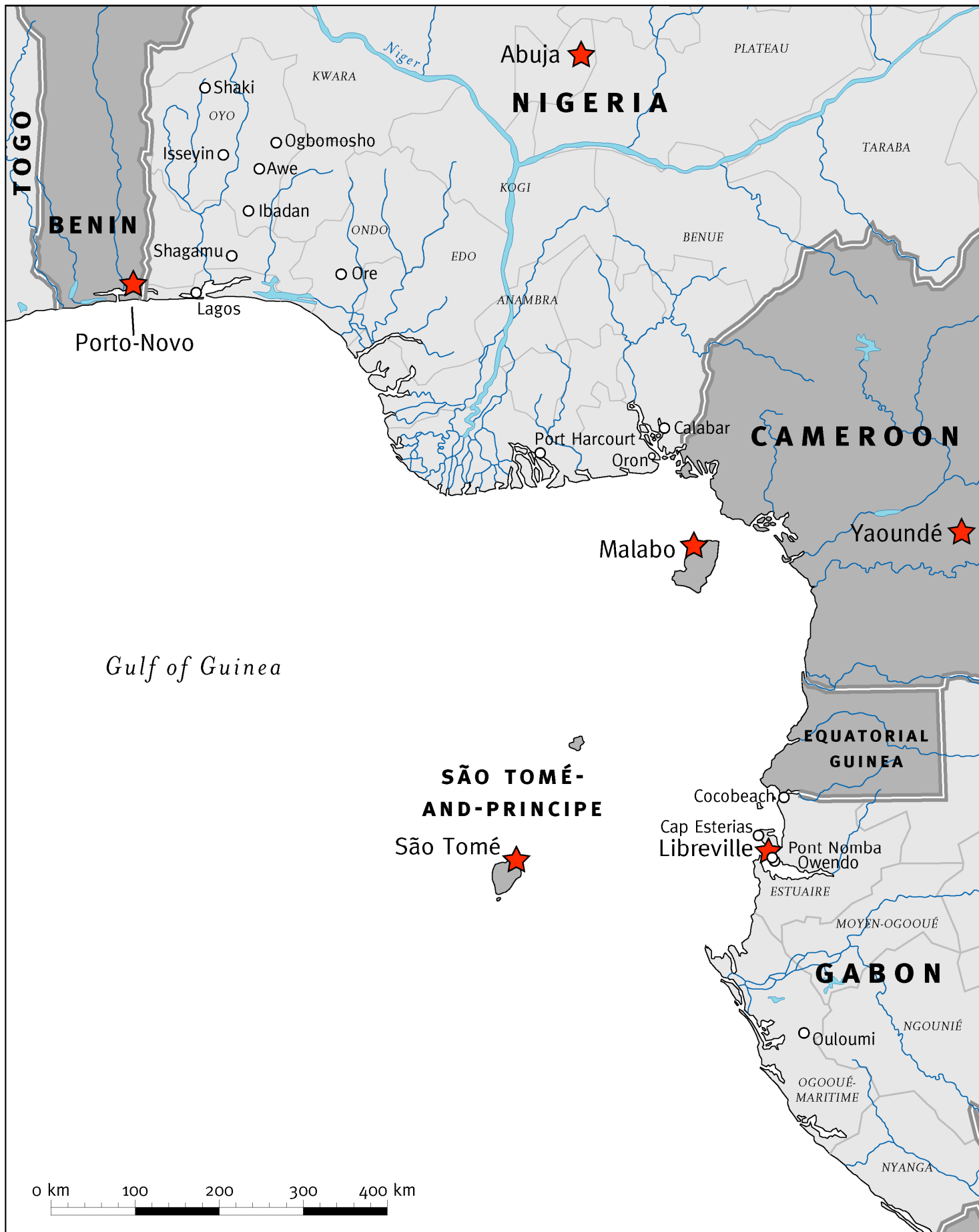
Cities and villages mentioned in this report