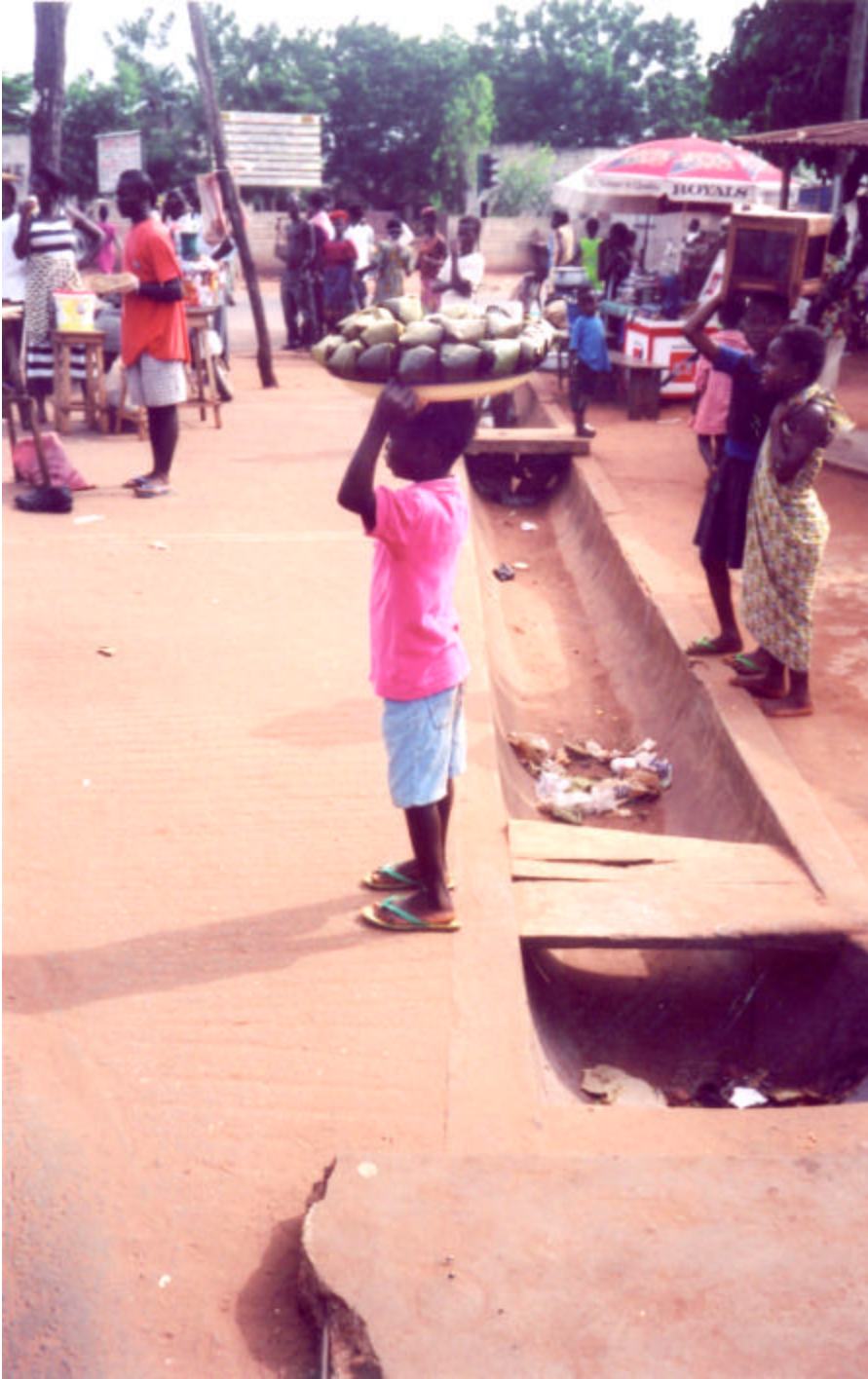
A young boy working in a market in Togo. Many trafficked children are forced to work in restaurants, markets, and homes.