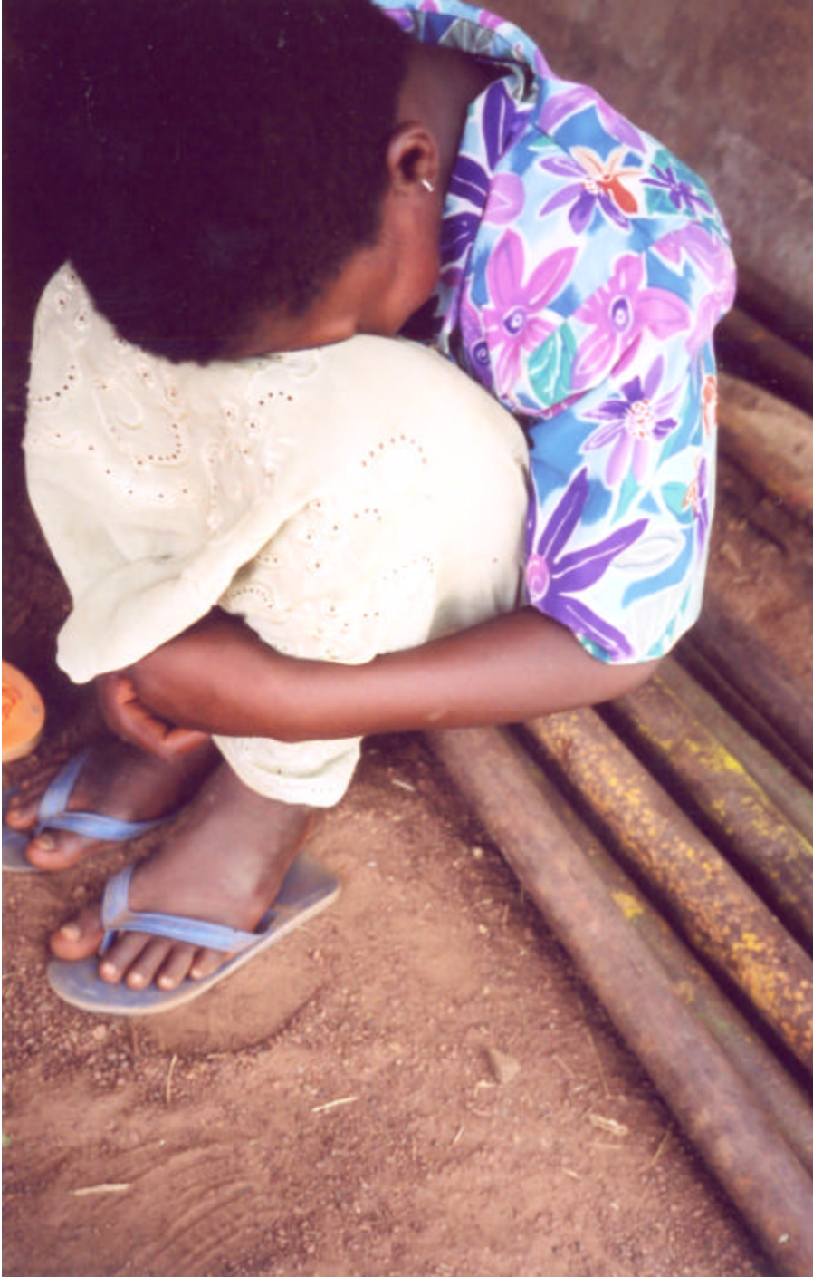
A young survivor of child trafficking in Togo.