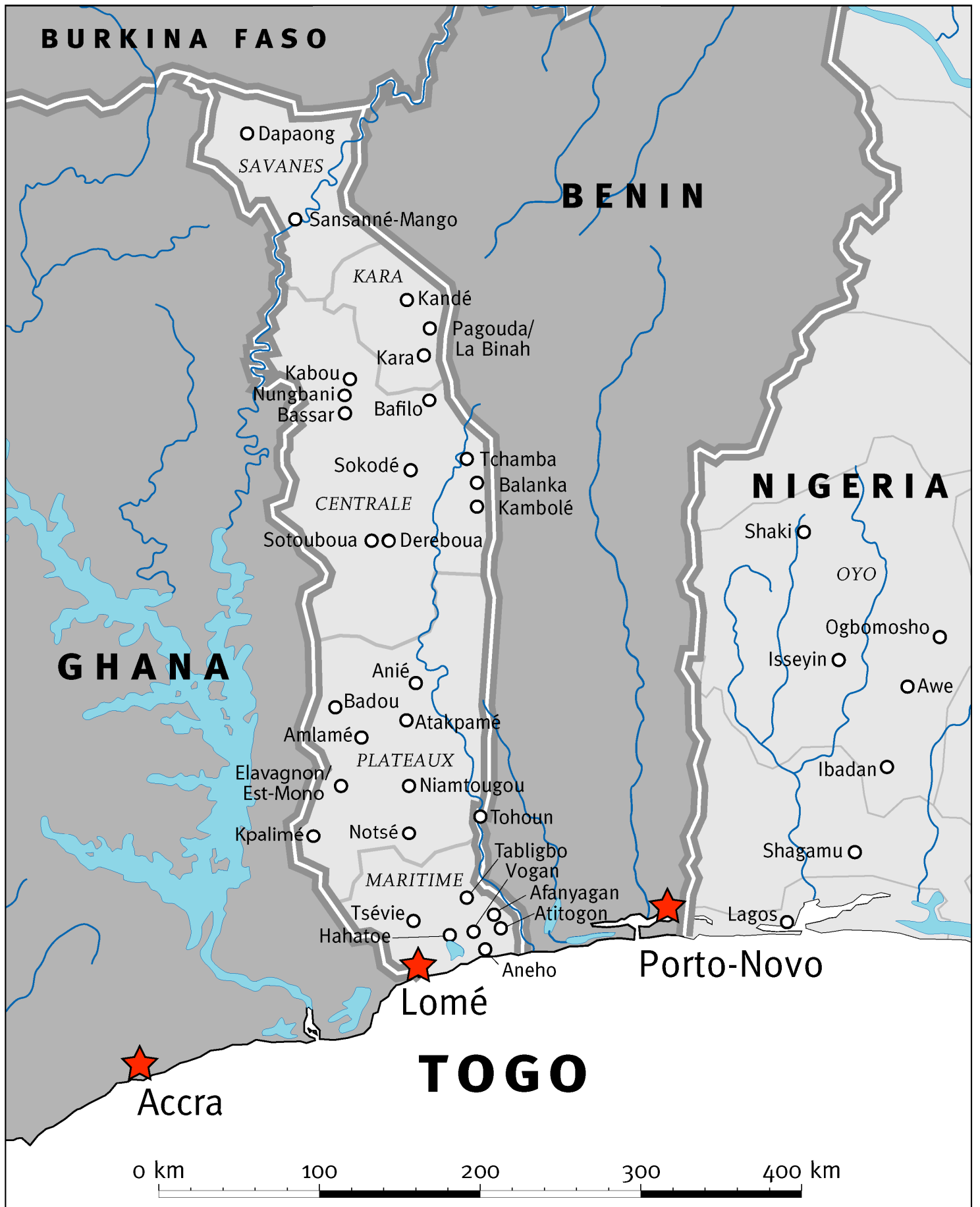
Cities and villages mentioned in this report