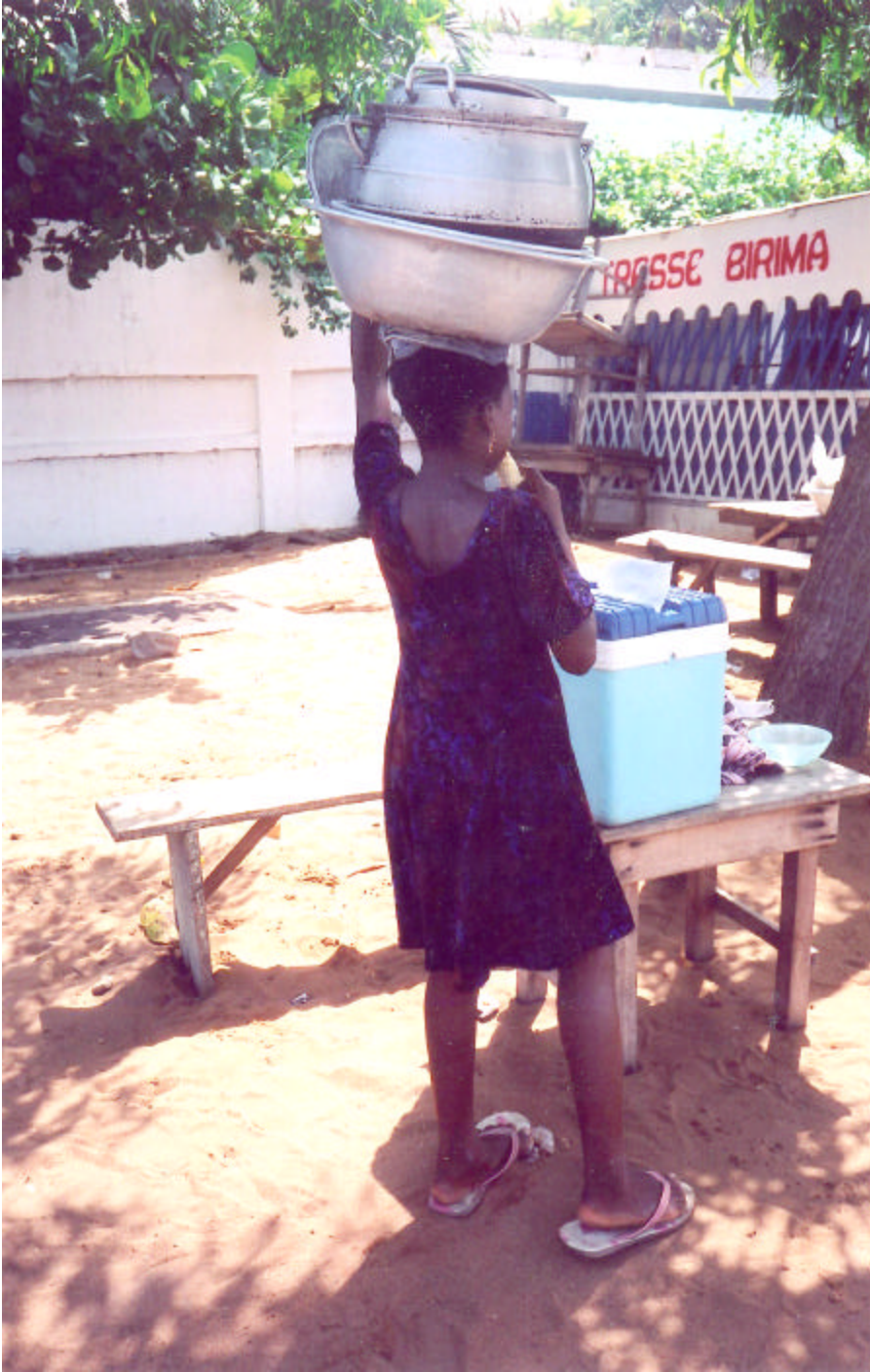
Too many children working in West Africa's markets have been trafficked from other countries.