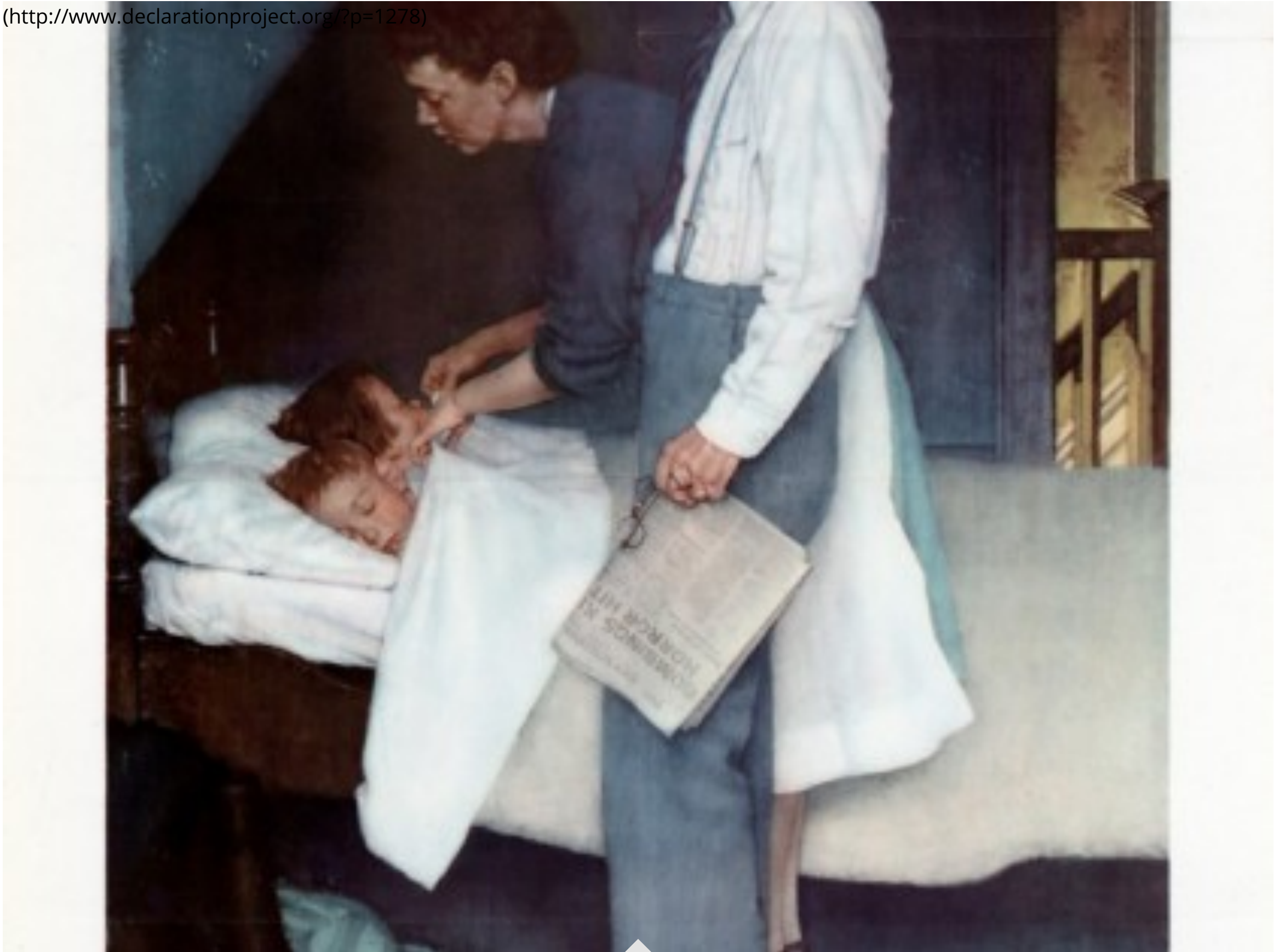
Everywhere in the World ( http://www.declarationproject.org/?p=1278 )

( http://www.declarationproject.org/?p=1278 )