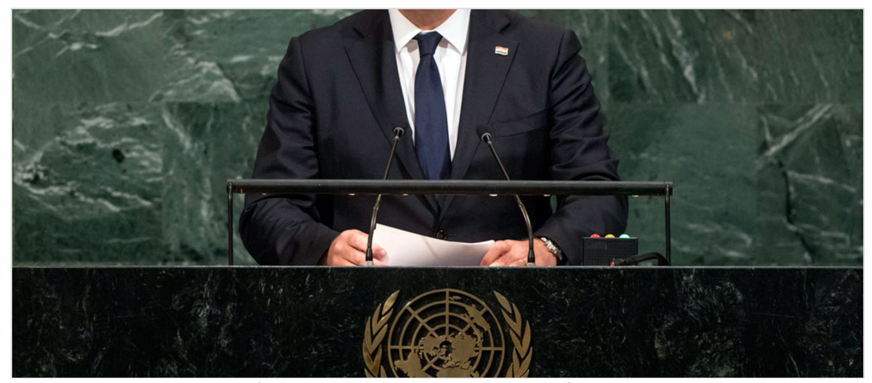
Prime Minister Andrej Plenkovic of Croatia addresses the general debate of the General Assembly's seventy-second session.

21 September 2017 – Croatia, a major way-station on the path of tens of thousands of refugees from the Middle East and Asia in 2015, called from the podium of the United Nations General Assembly today for a holistic approach that respects migrants' rights while tackling the root causes of their flight.