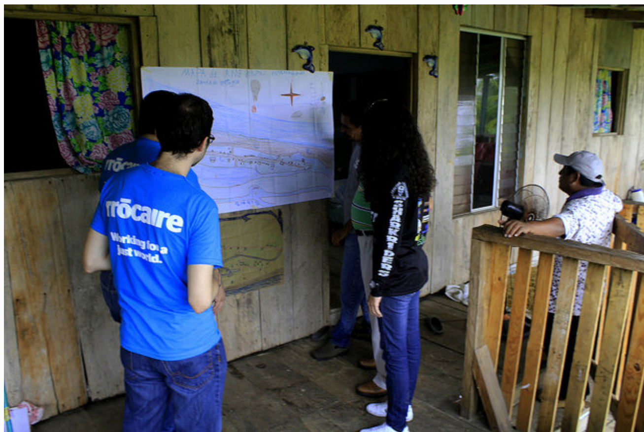
Trocaire (Caritas in Ireland) together with local partners put in place disaster plans for communities facing the threat of flooding.

"Natural disasters cannot be completely avoided, but there are ways to prevent loss of lives through strengthening countries' and local communities' preparedness and resilience," said Irene Broz of Caritas Internationalis.