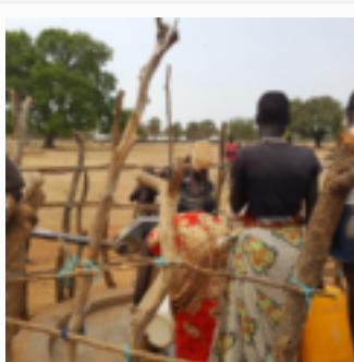
“Our people are witnessing mass