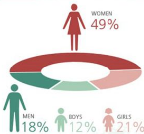
Detected victims of trafficking in persons, by age and gender, 2011