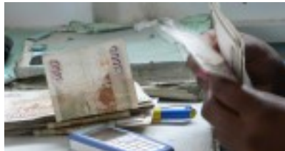
Africa hit by $1.8bn money transfer fees