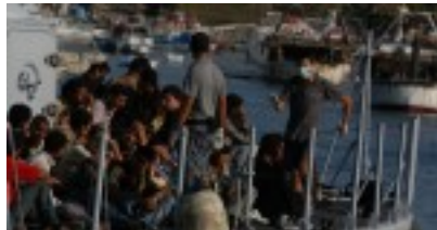
Are we wrong to focus on rights?