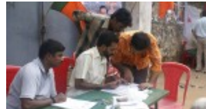
Indian elections: is corruption really top of the agenda?