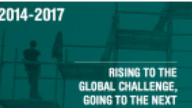
How ODI will make a difference

ODI and Comic Relief brought together key people from the world of banking, money transfers and politics (UK and African) for an event on the huge cost to Sub-Saharan Africa of high money transfer fees. Read the story of the event.