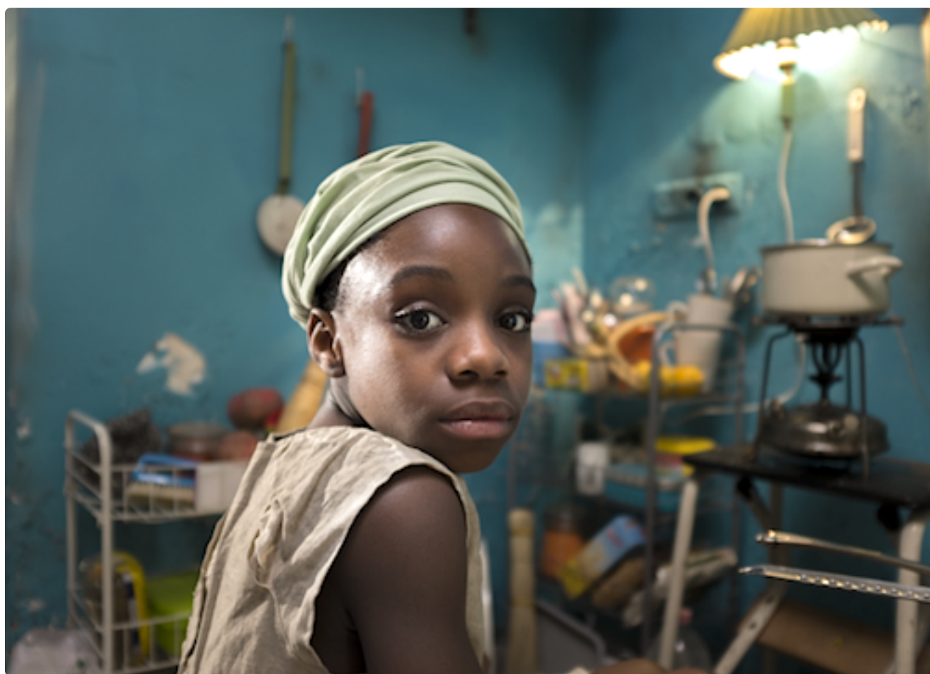
Photo from VR video "A day in the life of Amani" of Terre des Hommes Netherlands