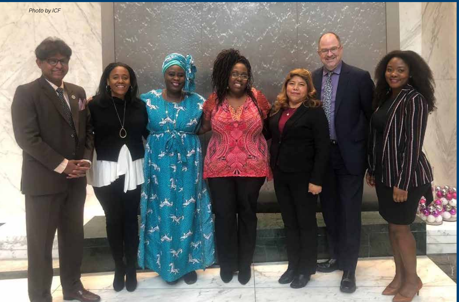
Members of the U.S. Advisory Council on Human Trafficking