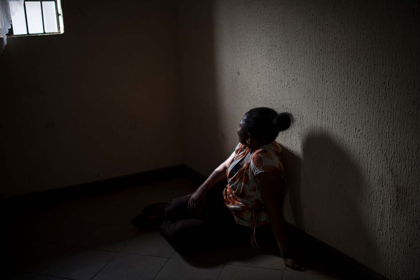
A Nigerian woman sits in a center in Benin City. After spending a year and three months in captivity in a run-down brothel in Turin, Italy, she was arrested by Italian security forces, and deported to Nigeria. Women lured by traffickers into leaving Nigeria sometimes flee violent conflicts; others are desperate to escape dire economic hardship or abusive family environments.

It is difficult to say how many women and girls are trafficked from, into, and within Nigeria, as there is no reliable data. However, Nigeria is routinely listed as one of the countries with large numbers of trafficking victims overseas, particularly in Europe, with victims identified in more than 34 countries in 2018, according to the US State Department Office to Monitor and Combat Trafficking in Persons. Most Nigerian trafficking victims in Europe come from Edo State, one of Nigeria’s 37 states, typically via Libya. The numbers of “potential” Nigerian trafficking victims in Italy has shot up in recent years. In 2017, the latest available data, IOM reported a 600 percent increase in the number of potential sex trafficking victims arriving in Italy by sea, with most arriving from Nigeria. The organization estimated that 80 percent of women and girls arriving from Nigeria—whose numbers had soared from