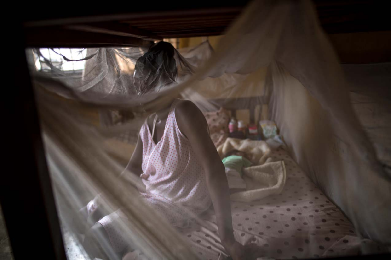
A woman from Cameroon sits with her baby in a private shelter in Lagos, Nigeria. When she was eight months pregnant, she was allowed to leave Libya on a flight organized by IOM and the Nigerian government, as humanitarian workers feared for her safety and that of the unborn baby. She told Time magazine, “The Libyans understood that if the EU doesn’t want blacks to come, it means we are not valuable as humans... The EU is essentially rewarding these militias for abusing us, for raping us, for killing us and for selling us.” March 2018.

1,454 in 2014 to 11,009 in 2016—were potential victims of trafficking for sexual exploitation in the streets and brothels of Europe.