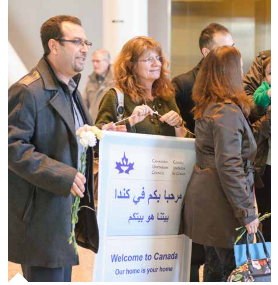
Canadians have welcomed some 275,000 refugees since 1979 through a program that has become a model for other countries.

While some have argued that responsibility sharing has achieved the status of customary international law, "the more widely-held view is that while the principle of responsibilityor burden-sharing is a critical norm of international refugee law,