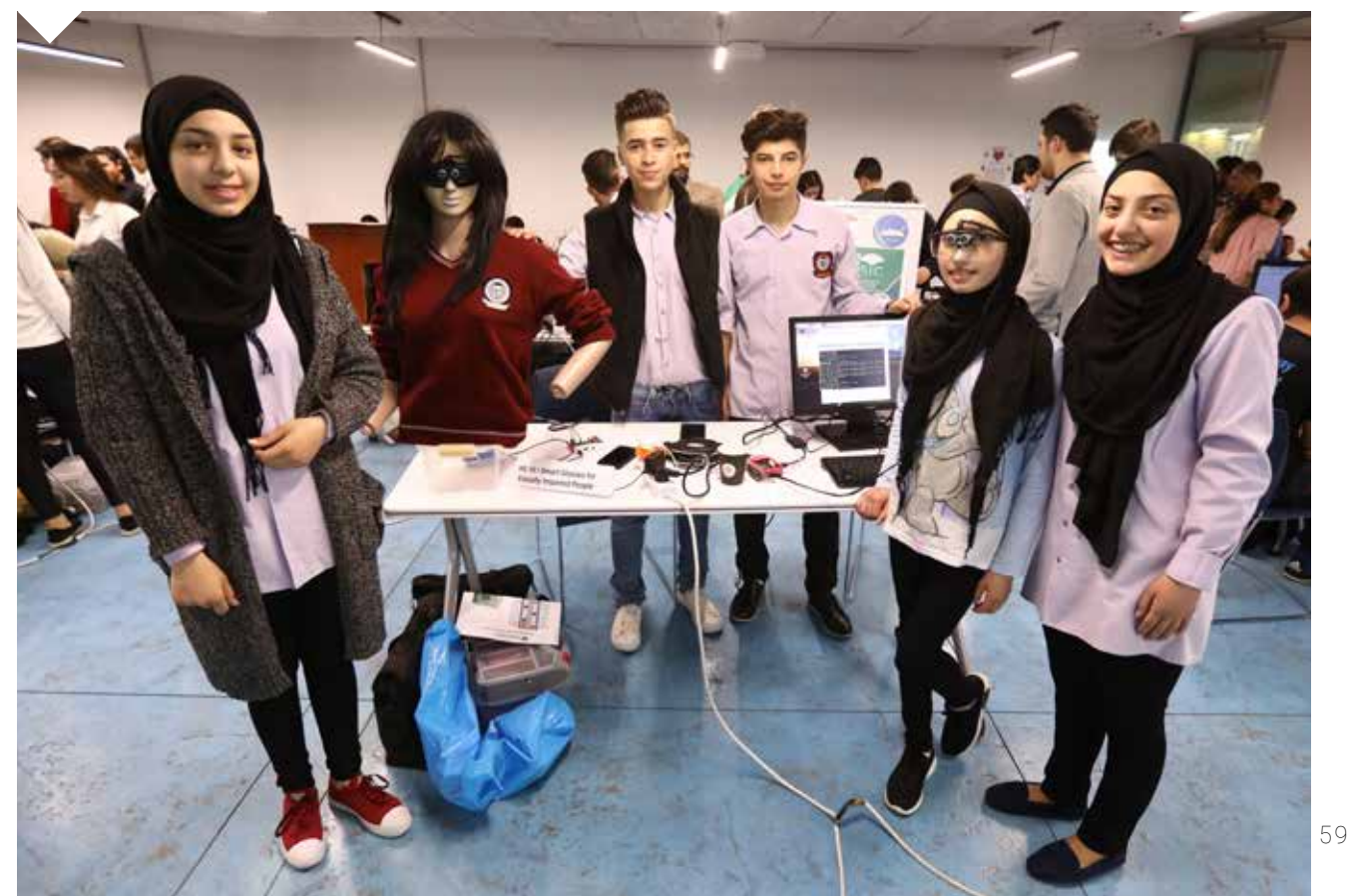
Syrian and Lebanese students collaborate on solutions using low-cost and accessible technology through programs in host community schools

Source: IDRC. For more information, see www.idrc.ca/en/project/digitallearning-innovations-syrian-refugees-and-host-communities and codermaker.org.