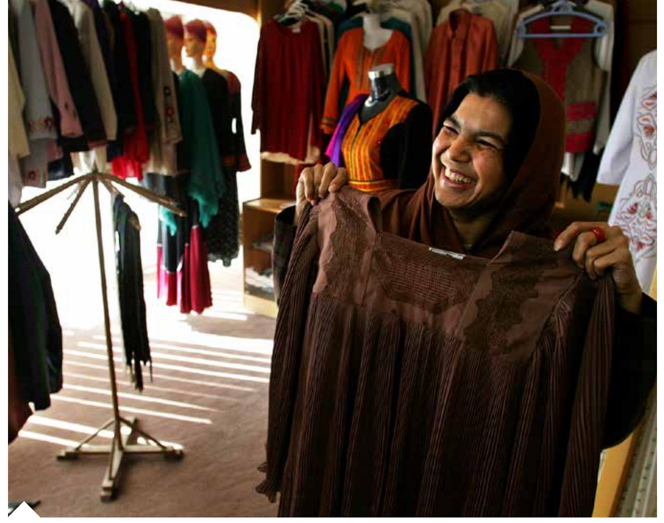
A former Afghan refugee makes and sells dresses at her clothing shop in Kabul. The dresses are made from burgas once mandatory under the Taliban regime.