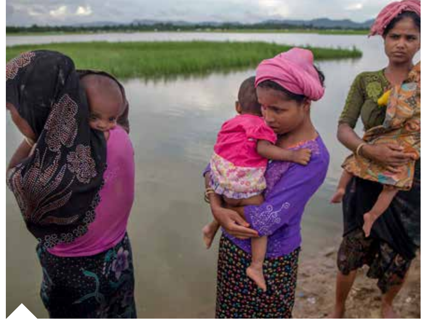
Rohingya Muslim women carry their sick children in Bangladesh. More than half of the world's refugees and IDPs are women or girls.

Fifth, there are real inequities in funding for refugees in different parts of the world — and probably even starker discrepancies for IDPs. In this regard, it is illustrative that several individual European countries spend more on processing and receiving thousands of asylum seekers than the UNHCR spends for all the rest