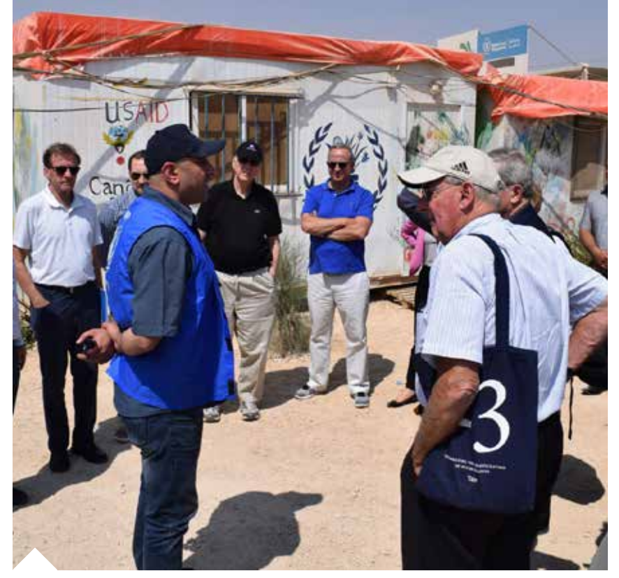
Zaatari refugee camp officials speak with WRC members.

international order is in jeopardy, as governments fail to protect their people and as the UN Security Council, largely paralyzed by the veto of its permanent members, is unable to prevent and resolve conflicts, and unable — or unwilling — to hold perpetrators of displacement accountable for their actions.