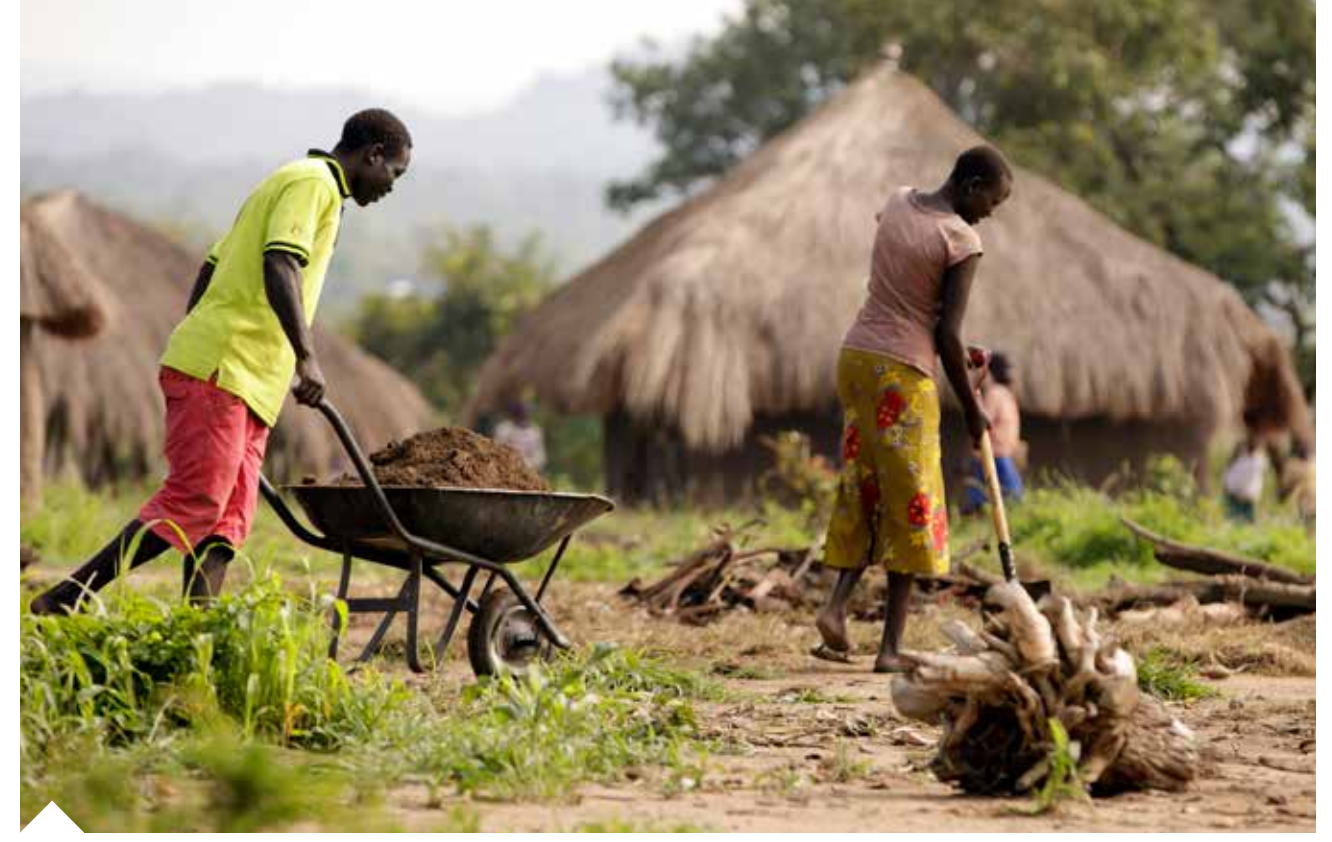
Two young people farm a field at the Rhino Refugee Camp Settlement in the north of Uganda, home to about 90,000 refugees from South Sudan.