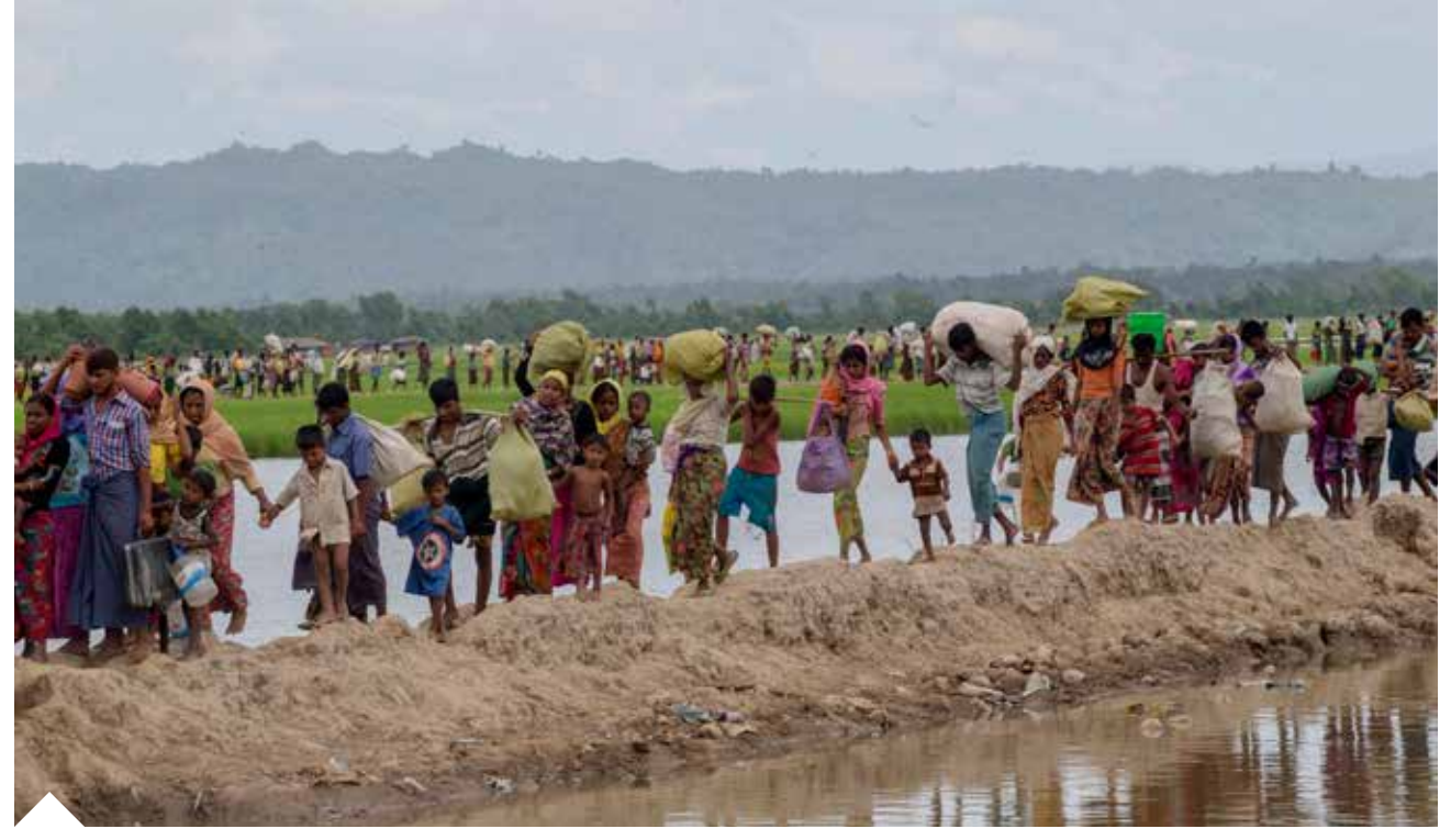
Forced from their villages in Myanmar, Rohingya Muslims cross into Bangladesh in late 2017.

Use International Criminal Law, in particular, the Rome Statute. The Rome Statute of the International Criminal Court includes "deportation or forcible transfer of population" as a crime against humanity "when committed as part of a widespread or systematic attack directed against any civilian population, with knowledge of the attack" (UNGA 1998, art. 7(1)(d)). While this provision is on the books, there have been few cases where it has been used (Orchard, forthcoming 2019). Vetoes by the permanent members of the UN Security Council have precluded prosecuting perpetrators who are under their protection.