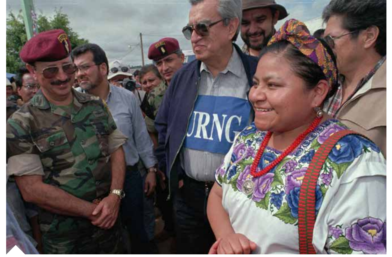
Nobel Peace Prize laureate Rigoberta Menchu played a key role in the Guatemalan peace process, a rare example of internally displaced people and refugees being involved in such negotiations.

While humanitarian agencies have generally done an excellent job in responding to the immediate needs of refugees and, in many cases, IDPs, their work is often carried out in isolation from others working on conflict prevention, conflict resolution and peace-building. Unlike the progress in closing the humanitariandevelopment gap, there has been little progress in overcoming the divide or peace — actors. While humanitarian agencies need to be politically aware, they are constrained from overt political activity by the principles of neutrality and independence that provide them some protection and credibility in difficult operating environments.