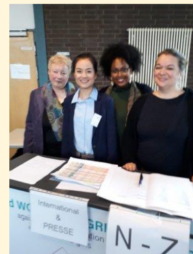
SOLWODI - Team