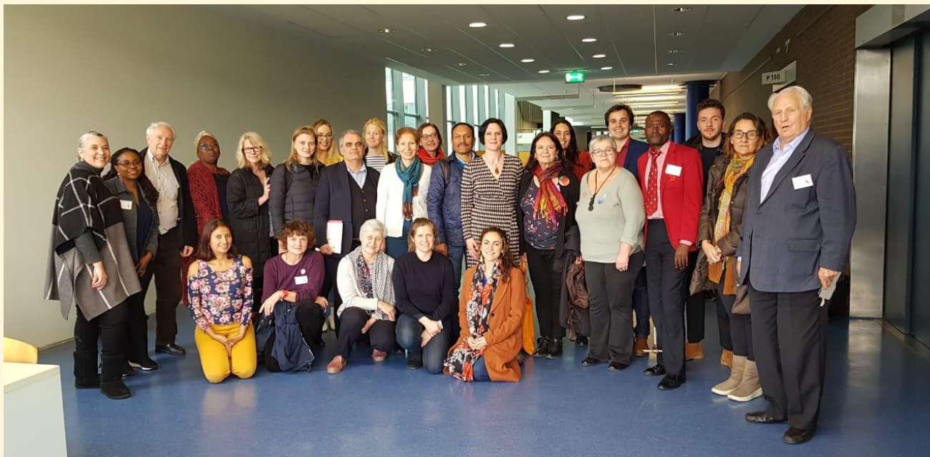
CAP INTERNATIONAL MEMBER BOARD