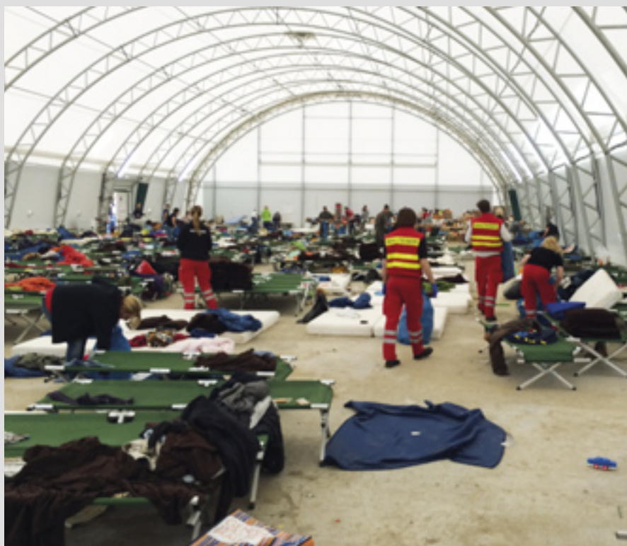
▲ Refugees are cared for on arrival in Austria. Malteser Hospitaldienst Austria has been providing a wide range of care for those in need since 1956