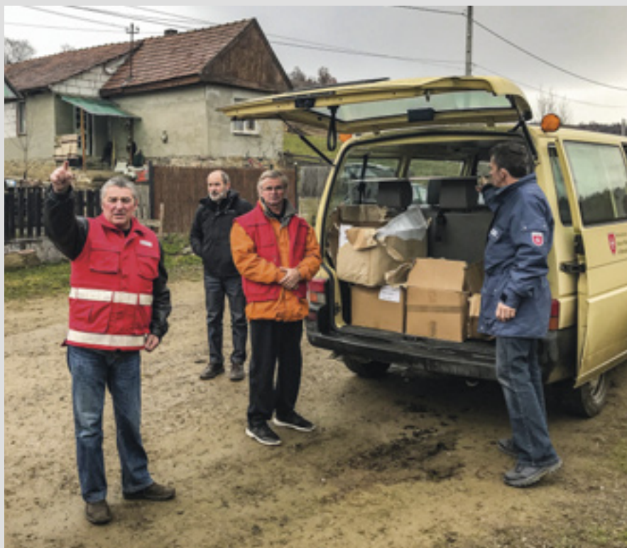
▲ In Eastern Europe, regular deliveries of supplies to impoverished local villages are a lifeline