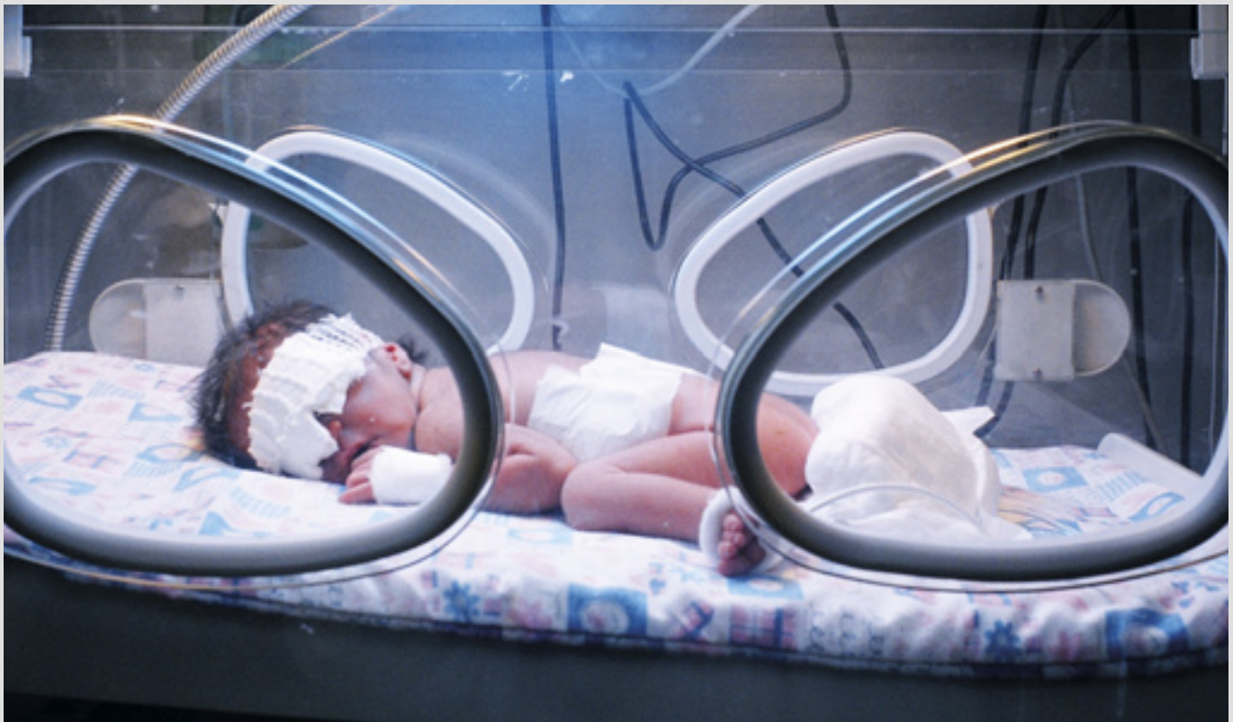
▲ The Order's Holy Family Hospital in Bethlehem offers the only neonatal intensive care unit for newborns in the region

A Dignity Loan programme launched in 2013 in the Salfit region by the Order's Representative Office to Palestine continues to give microeconomic loans to local small businesses, creating jobs and improving economic outcomes. In consultation with local community partners, the interest-free loans typically have a repayment period of 1-3