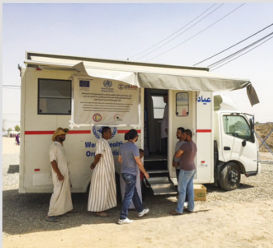
▲ Malteser International mobile medical teams provide medical aid to IDPs in camps around Erbil, Iraq

For the elderly in rural areas, where the exodus of the young for jobs in the cities brings loneliness, there are three day care centres and five 'warm homes', bringing companionship and social activities. They cater for 55 villages with a total of 1,168 elderly, for