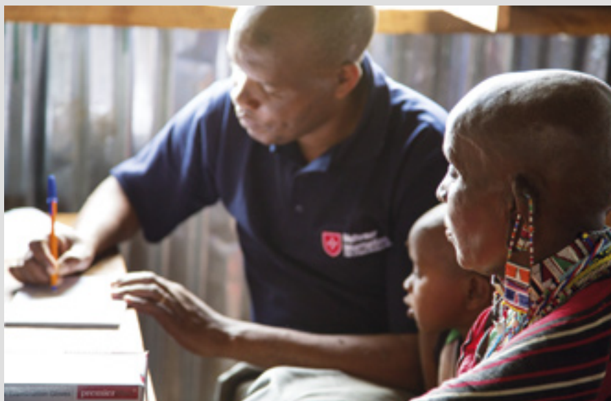
▲ A home visit to a patient suffering from tuberculosis, Oloitokitok, Kenya

The Order supports 12 clinics around the country – at Kayes, Koulikoro,