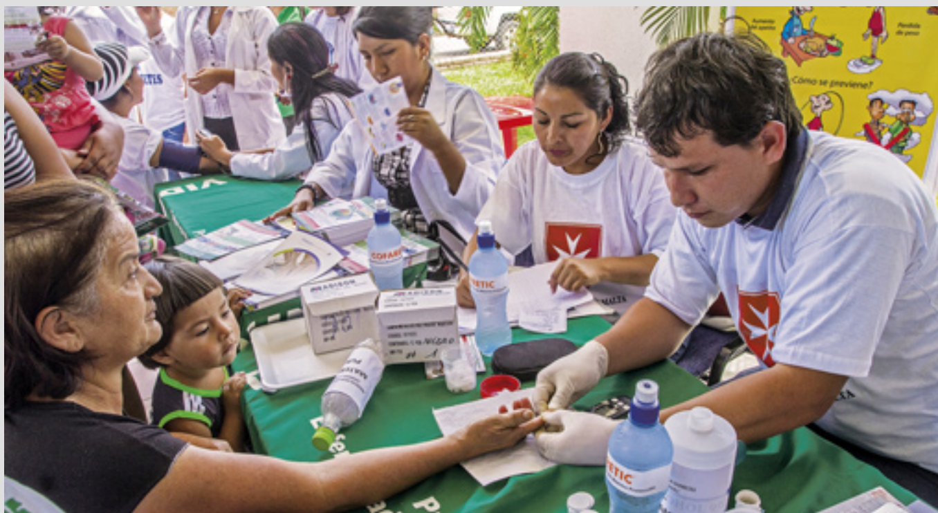
▲ World Day Against Diabetes, Bolivia: the Order, in collaboration with the University of Santa Cruz de la Sierra

Varela, south of Buenos Aires, provides free dental and eye care to more than 100 underprivileged children daily. For complex cases it has a cooperation agreement with the University of La Plata.