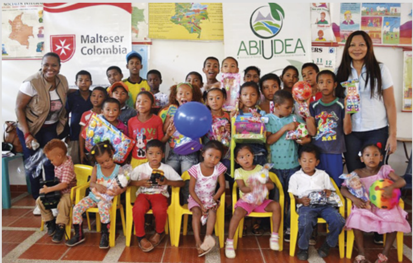
▲ Wide ranging projects in Colombia to aid refugee and indigenous groups in disadvantaged regions include educational activities for youngsters

ern Brazil: carries out activities in São Paulo through the Centro Asistencial Cruz de Malta, with members and 200 regular plus 200 occasional volunteers. Their health care projects aid nearly 60,000 people a year with medical care.