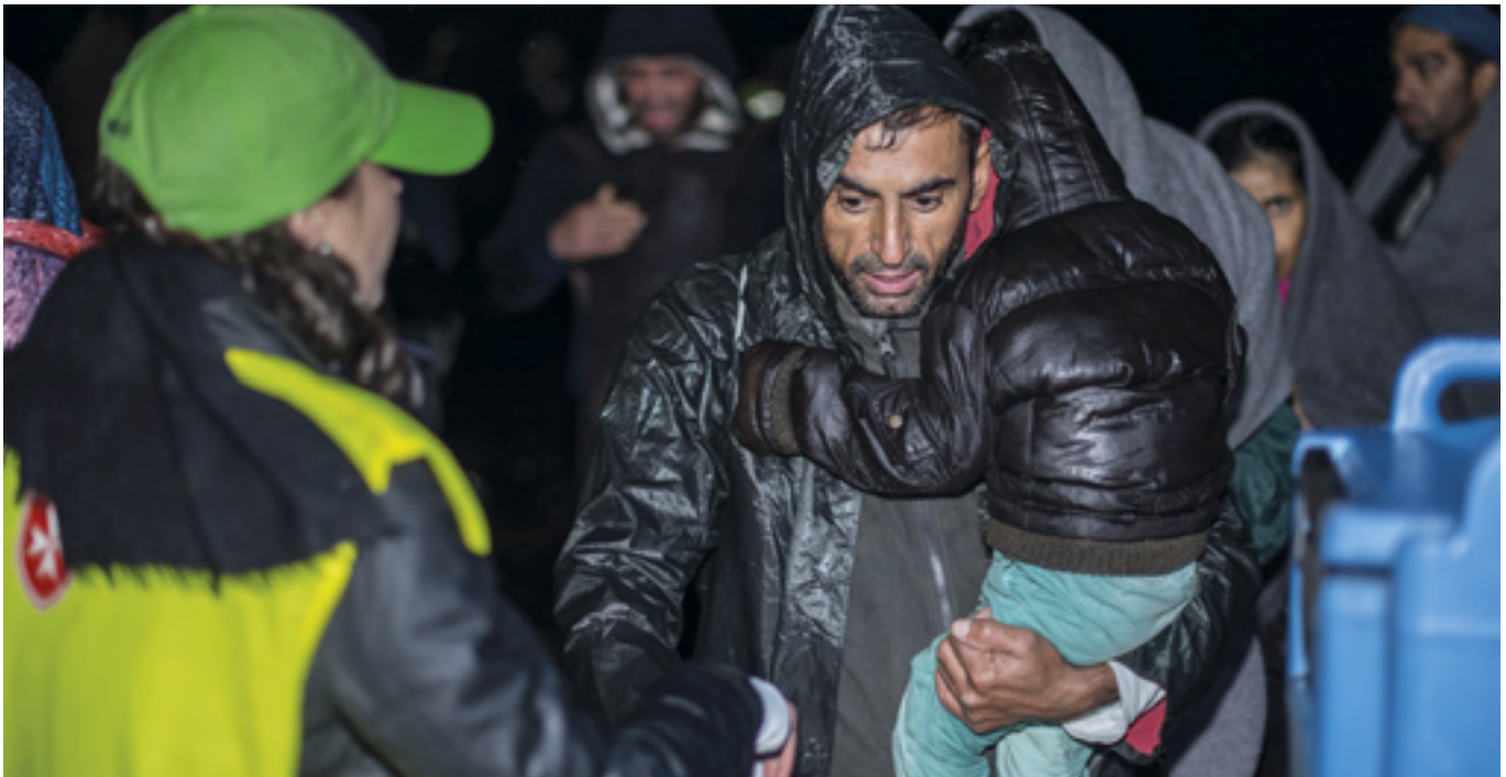
The Charity Service gives succour to refugees on the Serbo / Hungarian border with food, clothing and medical aid

Busy in his parish, as well as with the growing charity service of the Order of Malta, people came. They came and they stayed. 'Today I cannot tell a young person who is searching 'come and celebrate' because what he or she sees would be completely foreign to him or her. S/he has no value system! I ask, what is a healthy soul? There are two qualities: 1) the soul allows itself to be value-oriented towards universal values; 2) it has a conscience, which is responsibility towards another person. Today we see that there is a moral crisis, that is, no universally accepted values; and there is no sense of conscience because there is no feeling of responsibility towards other people.'