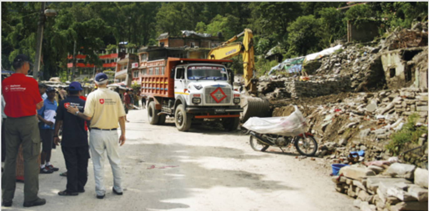
▲ The Order's international relief agency, immediately on site after the Nepal earthquake with emergency aid, is now rebuilding homes and livelihoods

mary health care, WASH, Disaster Risk Reduction programmes, climate change adaptation and post disaster relief. Another focus is health care for displaced people (the Rohingya) who have fled from Myanmar to Thailand and Bangladesh, where they do not have refugee status and are therefore not eligible for medical care.