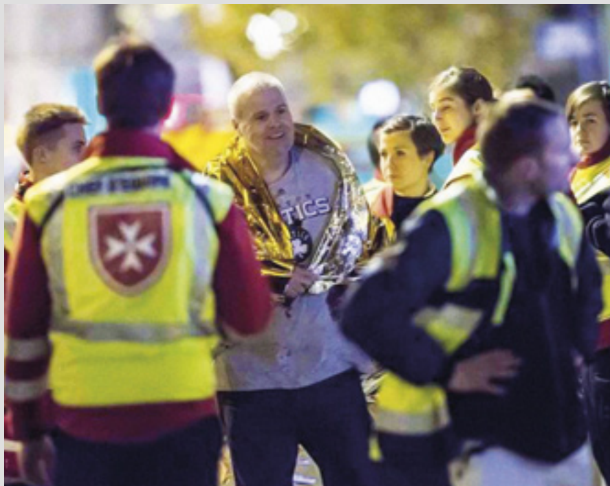
▲ Ordre de Malte France intervenes during the Bataclan attack

The Order of Malta in Germany operates an extensive range of care programmes across the country through its relief corps, Malteser Hilfsdienst (MHD). Founded in 1953, the relief service is now one of the largest charitable service providers in Germany. A