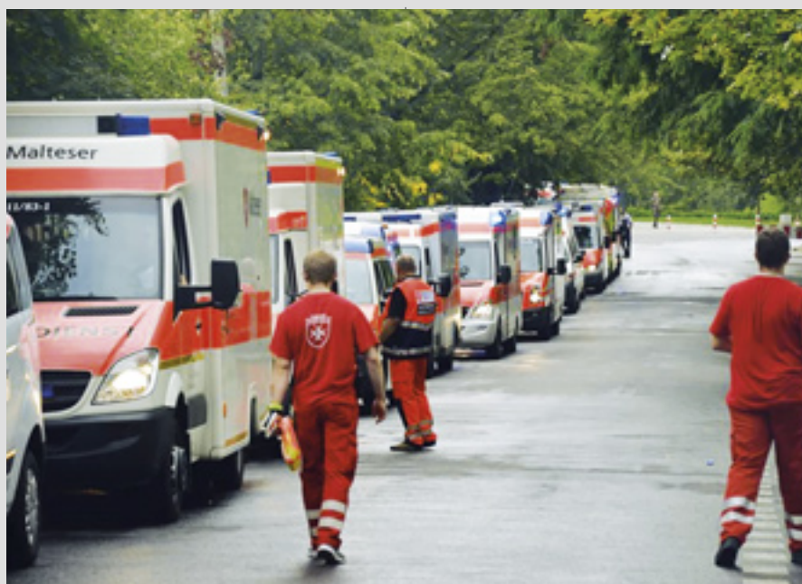
▲ Lineup of Order ambulances – medical support for World Youth Day in Krakow, 2016

mentoring for small numbers of homeless youths. A team of members and volunteers have accompanied guests to the Order's International Camps each year – 2016, 2017, 2018.