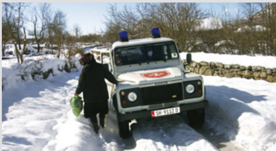
▲ Harsh winters in the north of the country mean emergency callouts for the Order's Relief Organisation in Albania (MNSH)

Malteser Hospitaldienst Austria (MH-DA), the Order's Austrian relief organisation, founded in 1956 and today a significant volunteer emergency service in the country, counts 2,000 volunteers, who, together with Order members,