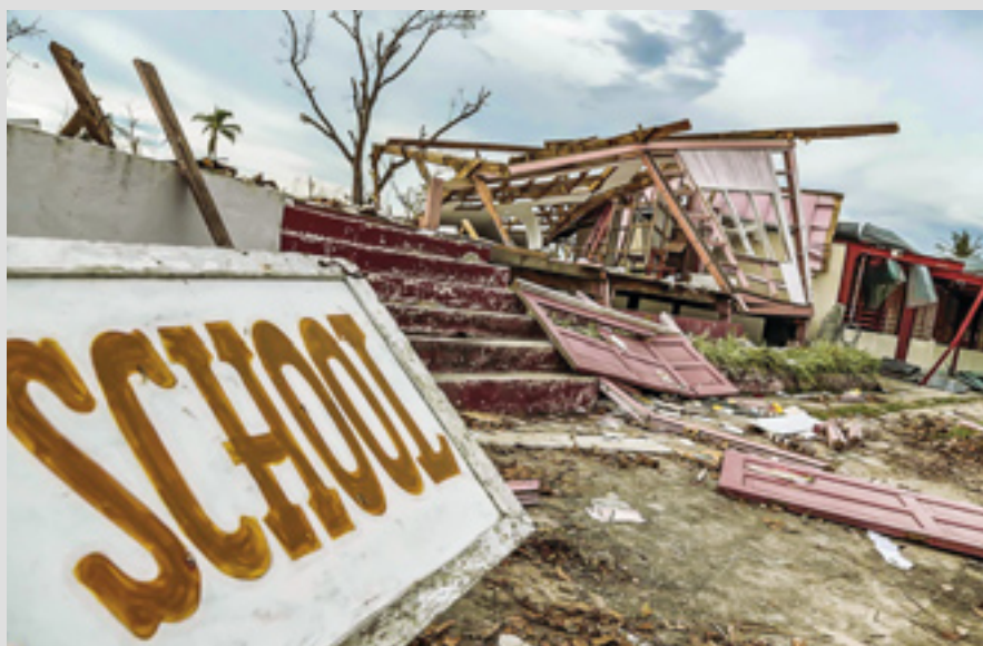
▲ The Order runs disaster risk reduction programmes in southern Asia, where hurricanes are a regular phenomenon

In 2016 the Embassy cared for 60 sick people, some of them terminal patients, providing medicines and food through the 'Healthcare Tbilisi' project. From 2017, among the Embassy's proj-