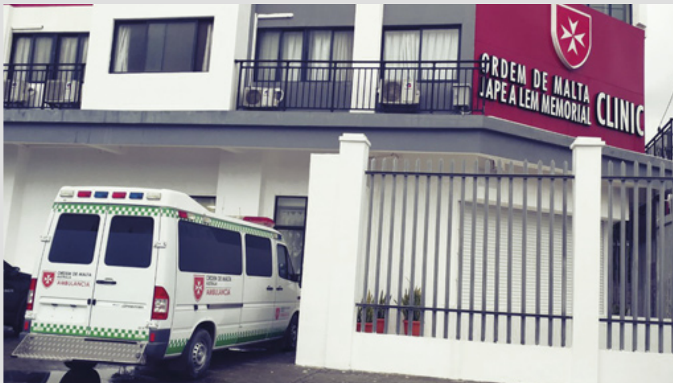
▲ The Order's clinic in Timor-Leste treats 200 patients every day

time called the Malteser Foreign Aid Service. Fifty years on, the organisation now has a special emphasis in the central provinces, among the poorest areas in the country, on disaster risk reduction awareness, in particular for the risks posed to the disabled caught up in these crises. Training workshops for their inclusion in DRR are given at community, district and regional level. In Vietnam 7.8% of people have one or more disabilities. Malteser International also runs a variety of activities: hygiene education in schools, nutrition awareness, forest preservation as well as disaster preparedness in villages. Ordre de Malte France runs six medical centres in the country, with operating theatres specialised in treating leprosy. The centres in Ben San, Cantho, Nha Trang, Quy Hoa and Ho Chi Minh Ville deal with rehabilitation surgery for leprosy patients, in Diling treatment is for diabetic and leprosy ulcers and in Quy Hoa, specialisations are in ophthalmology.