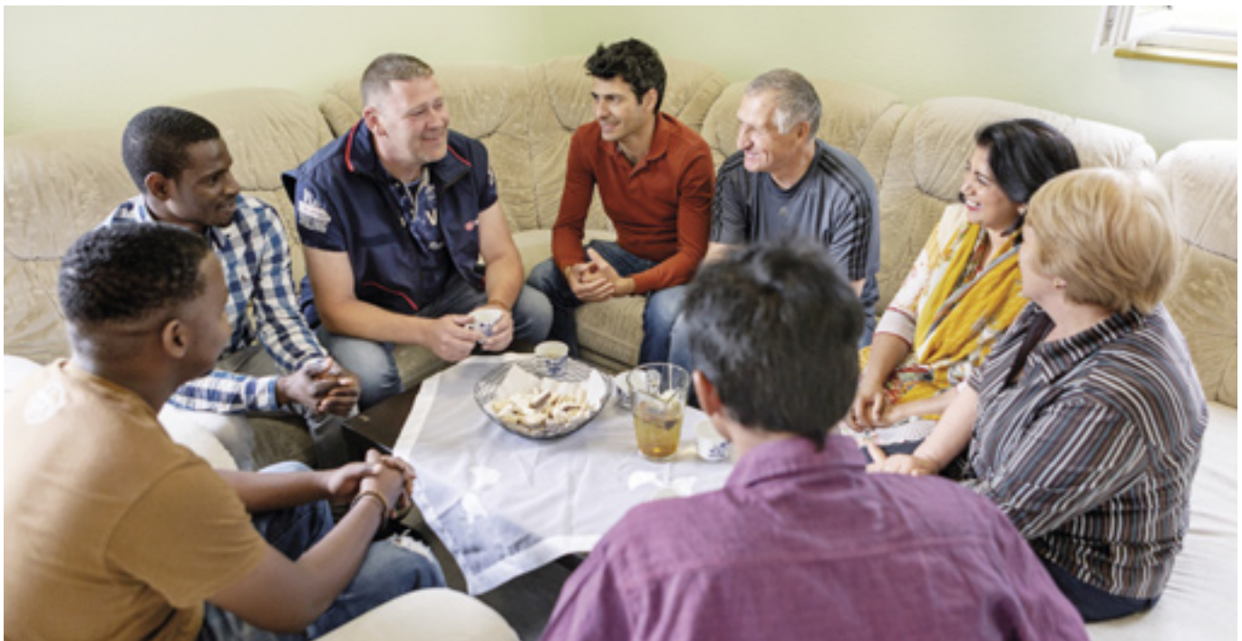
Malteser Germany runs integration programmes in a range of facilities

The consideration of "migration" as a problem can be from three points of view: First point of view is that of the people who make an experience of life-threatening situations, before which there is no choice, but to flee: to move away, to migrate from life-threatening to peaceful or life-assuring situations of places. In this case, the reaction of the communities of the world is to help remove the source of the life-threatening danger, whatever it may be. If it is war, as in the case of the present migration, then the reaction of the world is to quench the fires of war. A cessation of hostilities