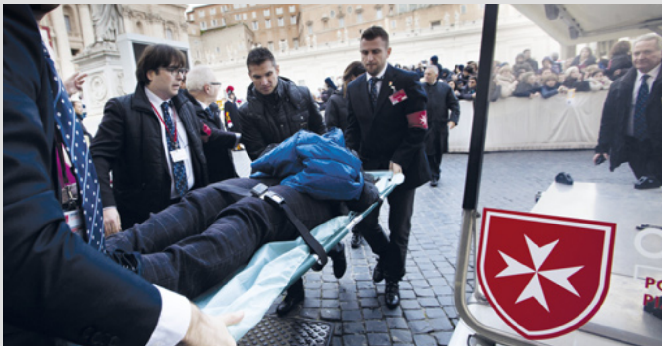
▲ The First Aid Post operates every day on both sides of St Peter's Square

From April 2018 first aid services in San Paolo Fuori le Mura and San Giovanni in Laterano have been added.