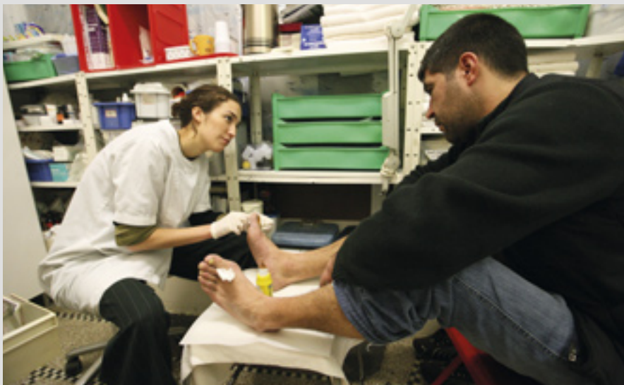
▲ Three day centres for the homeless in Belgium offer their guests showers, laundry, warm food, clothing and basic medical care

The Embassy of the Order in Bosnia and Herzegovina, in collaboration with German Malteser Hilfsdienst teams, organises an ambulance service in Medjugorje during the pilgrimage season (April to October) with local volunteer doctors and helpers (averaging 6,000 medical interventions). The Embassy also supports Catholic parishes, with help for restoring and re-equipping churches, such as the support for the parish church of Bl.Majke Terezije, Vogošća, recently donating bells for the bell tower and material to build a wooden pedestrian bridge to connect the parish with the village. In collaboration with the Law Faculty of University of Sarajevo and the Bucerius Law School in Hamburg, an international university post-graduate exchange programme trains students in constitutional and EU law.