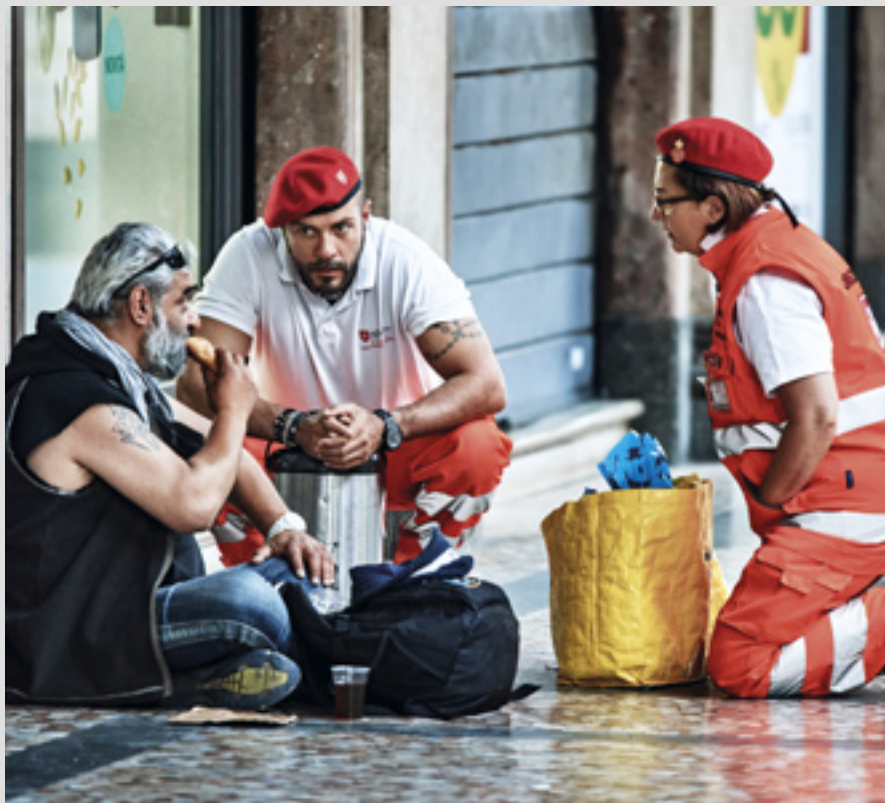
▲ The Italian Relief Corps runs many activities, including distribution of food for the destitute

New activities: a refreshments trolley service for patients at the Sir Anthony Mamo Oncology Centre, launched in 2016; a prison ministry project for young foreign inmates at the Corradino Correctional Facility, with regular visits, and psychological support as they enter rehabilitation programmes. The Order organises an annual Thanksgiving Supper and a summer barbeque for all inmates at the Young Persons Offenders Unit in Mtaħleb; and a forthcoming project to provide shelter and