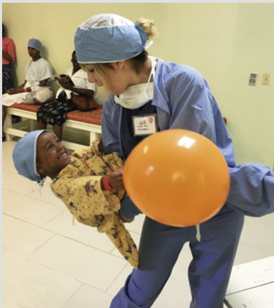
▲ The Dominican Association manages mother and childcare in poor areas of Santo Domingo