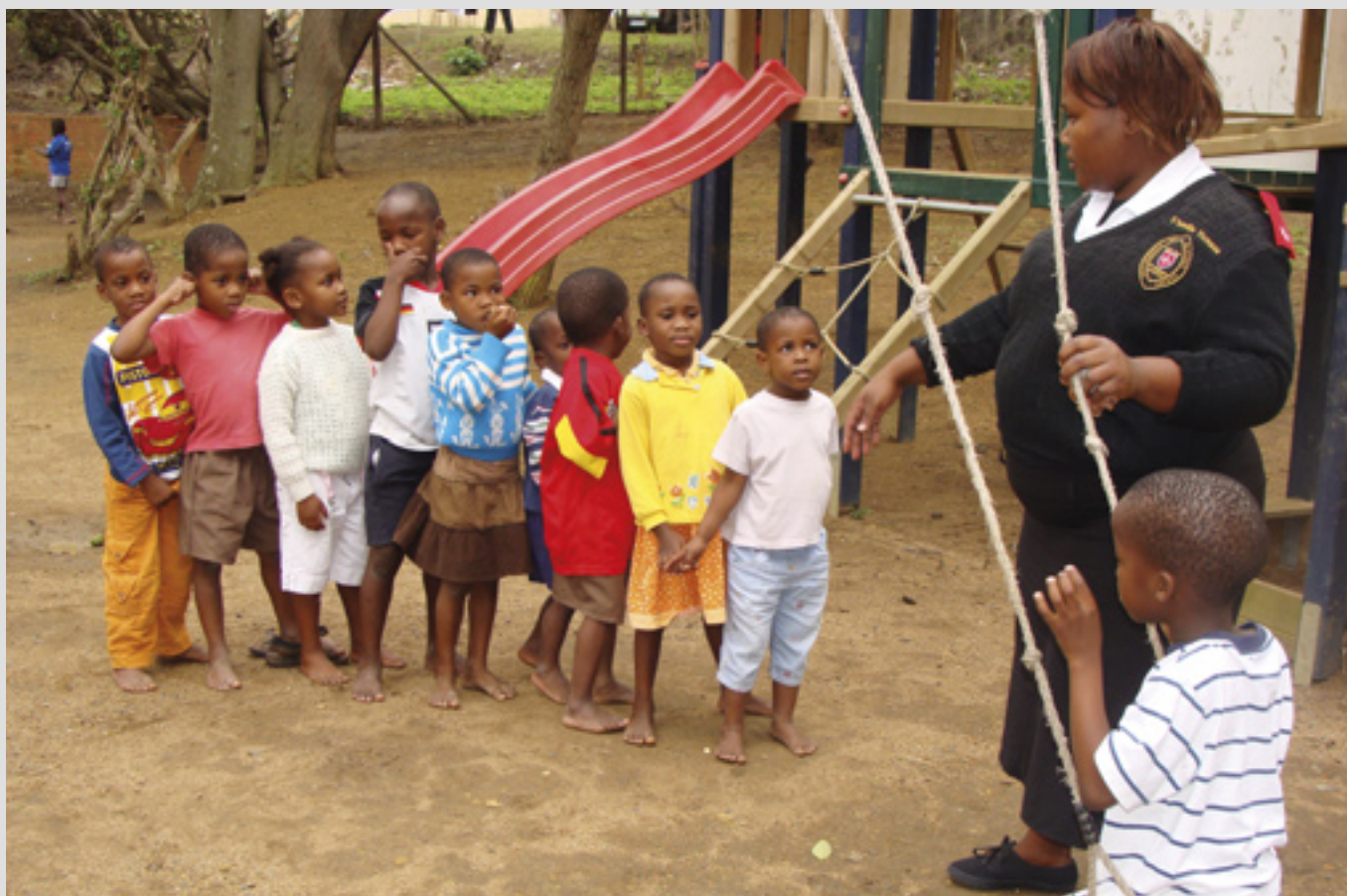
▲ At the Brotherhood of Blessed Gérard, South Africa, teachers work with young orphans

Hospice and palliative care: there is residential palliative care for terminally ill patients in the inpatient unit. It can accommodate up to 40 patients. In