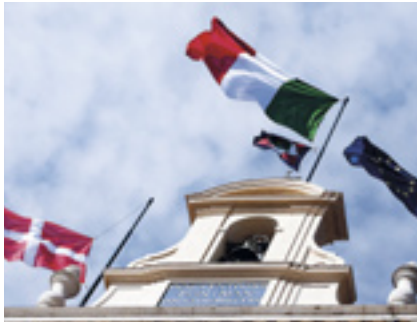
The Order's flag flies over the Quirinal Palace, seat of the President of the Italian Republic