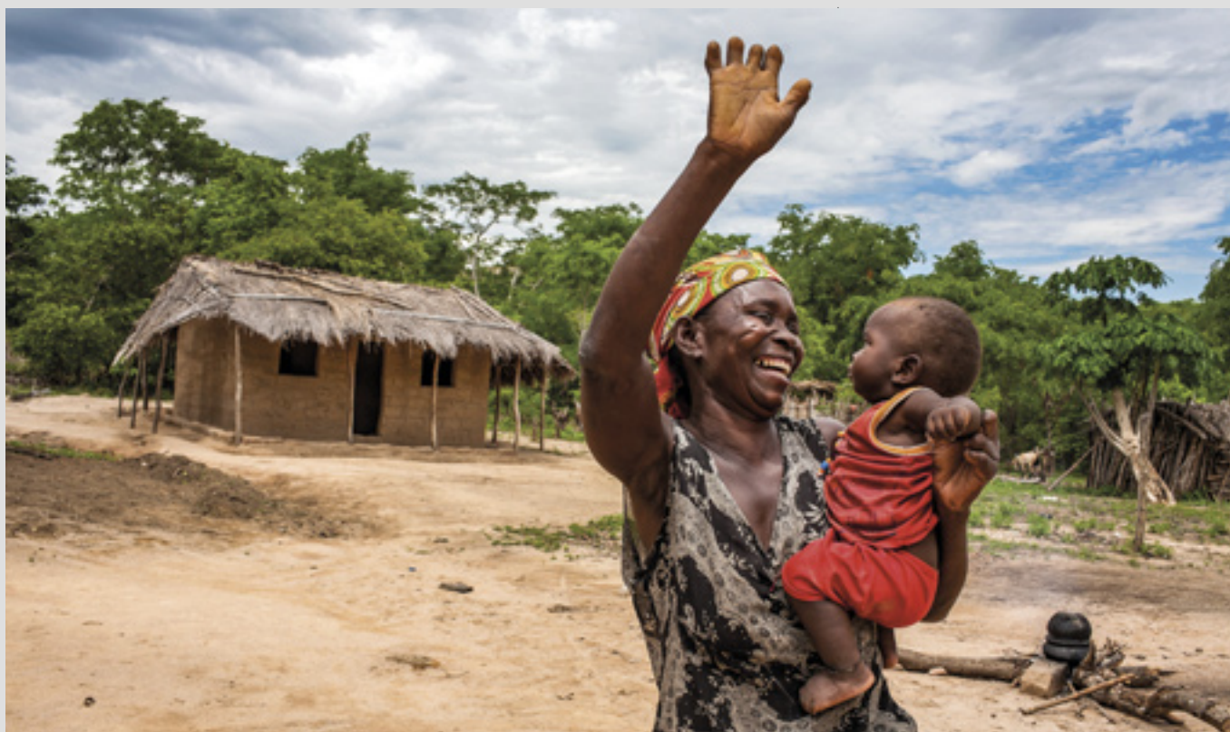
▲ The Order focuses on care for leprosy sufferers, showing them how to look after themselves

to give support to the Abu Zaabal Leprosarium, north of Cairo.