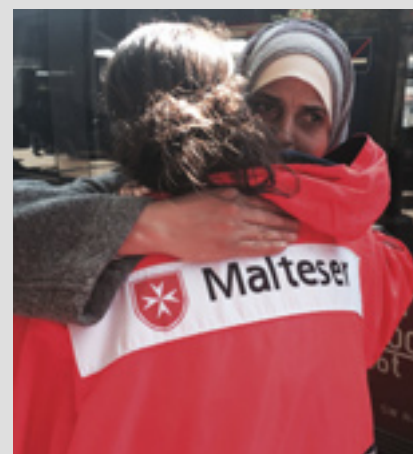
▲ Closeness counts: Malteser Hilfsdienst runs care programmes nationwide

Trained staff also run outpatient care for sufferers in their own homes, and outpatient services also include training for relatives and advice on nursing care and long-term care.