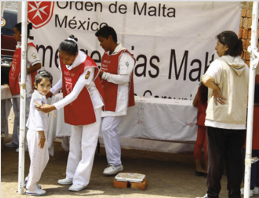
▲ Healthcare event for disadvantaged youngsters in Mexico City