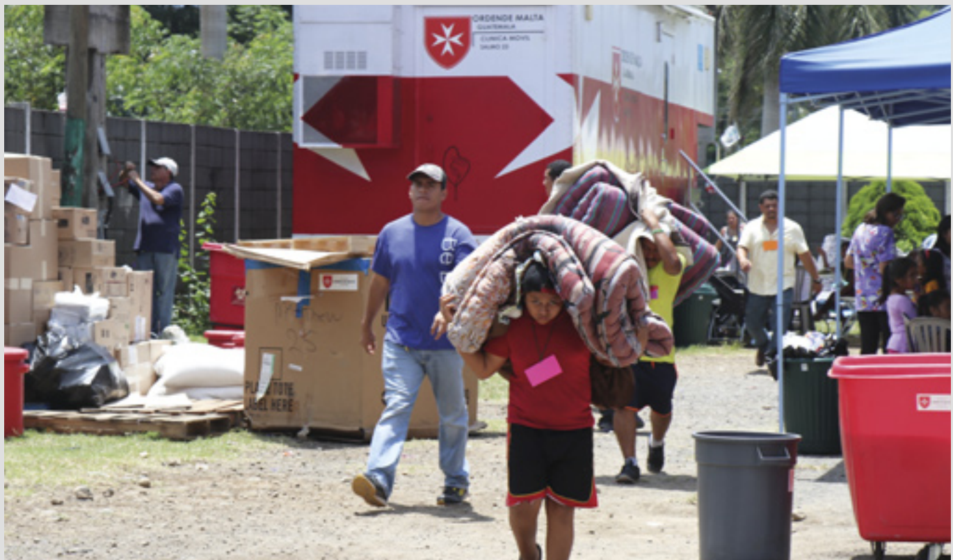
▲ Mobile clinic, Guatemala, delivers basic goods to outlying villages following the volcano eruption

The Order's Embassy has provided direct assistance to local beneficiaries by channelling all donations and dealing with administrative issues. Beneficiaries were the 'Bless the Children' Foundation in the Progreso region, to support children with drug addiction; to 'Our Sisters of Notre Dame' who have set up homes for children and older people in the Progreso region; to