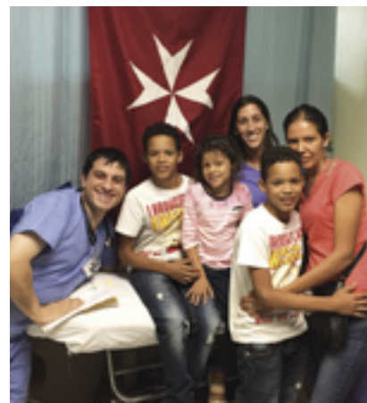
Volunteer medical missions in the Dominican Republic treat locals free of charge, attending to thousands of patients each year

In 2017 the San Juan Bosco Clinic celebrated 25 years of service to the community of documented and non-documented poor in Miami. Members of the Cuban Association continue to volunteer their time and over 800 patients are seen every year and, where necessary, are referred to specialists who provide over 2,800 annual visits free of charge.