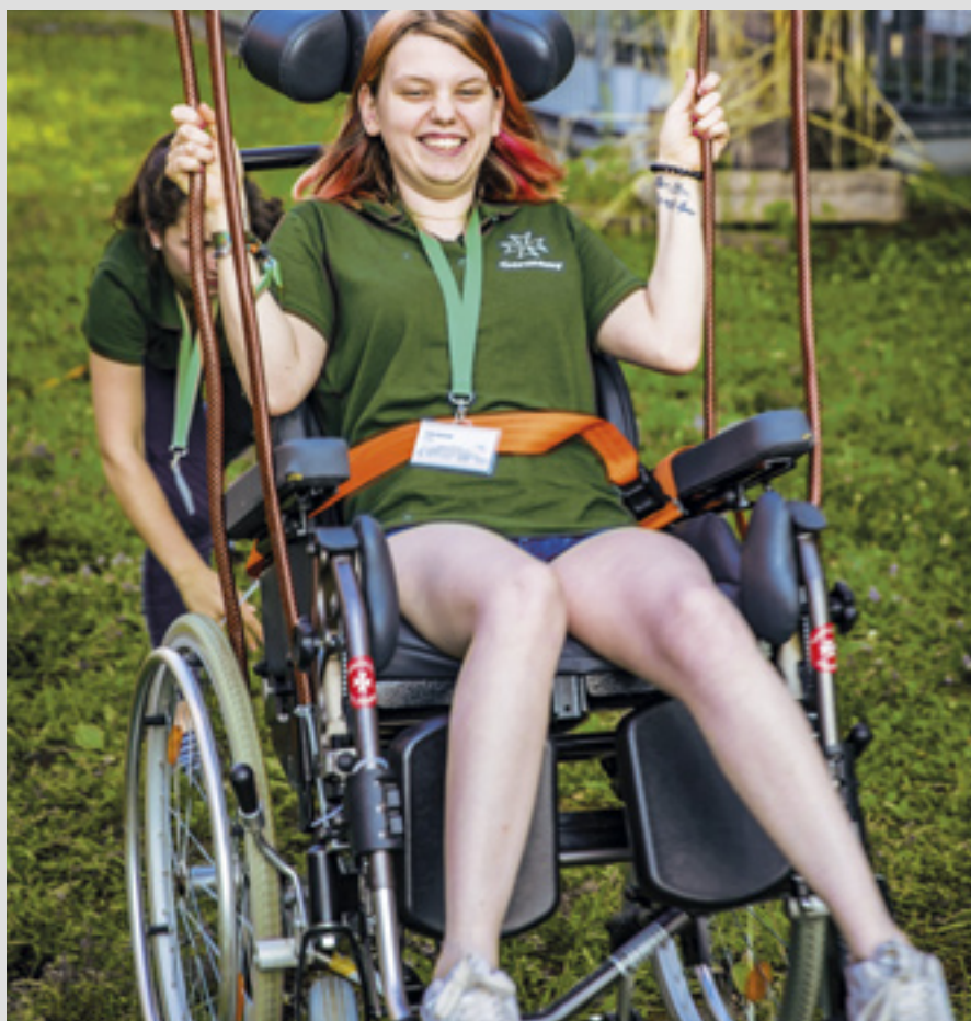
▲ 4,000 volunteers divided into 80 units form the Ambulance Corps in Ireland

conditions offer a relaxing time for all. With 800 participants in 2016 over 12 weekends, the response has far exceeded expected participation in the project. A project to provide food, clothing and support for the homeless in St Stephens Green in Dublin – the ‘Knight Run’ - has been operating since 2014. Guests and carers participated in the Order’s International Summer Camp for Young Disabled in 2016, 2017, 2018.