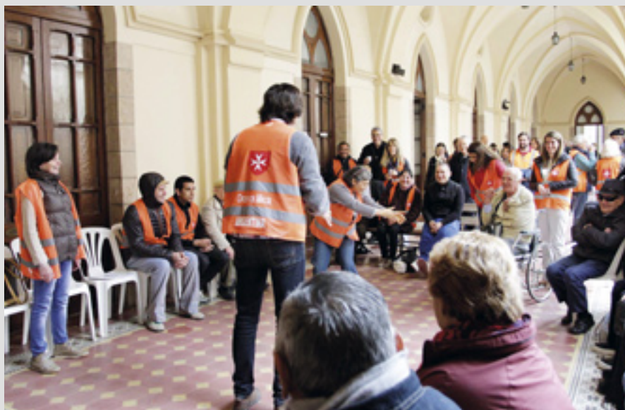
▲ Argentina - Activities and games participation help cheer disabled guests