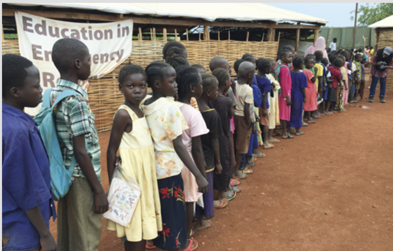
▲ School pupils line up for hot, nourishing meals in South Sudan, provided by the Order's Malteser International

Ordre de Malte France has also signed a cooperation agreement with the DAHW (Deutsche Lepra- und Tuberkulosehilfe e.V.) for detection of tuberculosis and leprosy including cases in remote villages. A second partnership has been signed with Hilfe für Senegal who donated medical equipment (wheelchairs, crutches, etc.) to the dispensary in Gorée.