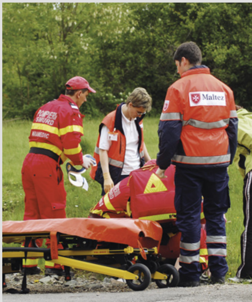
▲ Regular first-aid courses for volunteers in the Serviciul de Ajutor Maltez, Romania: 1,000 work in 100 projects in 26 locations

An important initiative started in 2016 is the development of programmes for Roma people in Pauleasca, in Satu Mare (educating Roma children) and