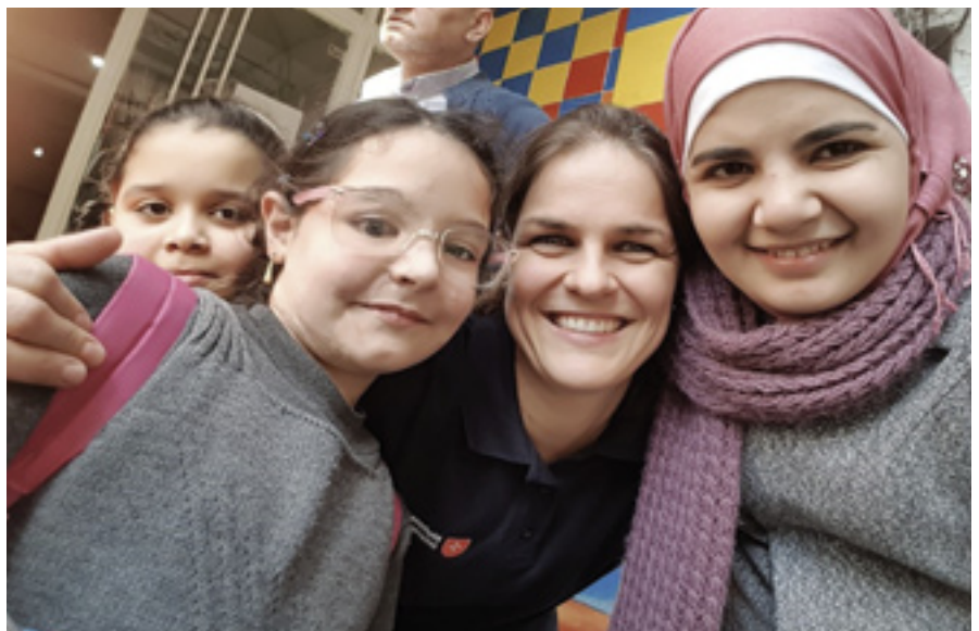
Young refugee students at the Order's school in Kilis, Turkey, integrating into the host country

As well as medical care in the rehabilitation hospital, psychologists and social workers have developed a support programme for patients and their families. Patients come from a cultural background where psychological pathologies are stigmatised, so it is challenging to encourage them to express negative feelings. Making a living in a foreign country while surviving in very crowded housing situations is sometimes more stressful than the experience of violence and harsh conditions during the flight from Syria.