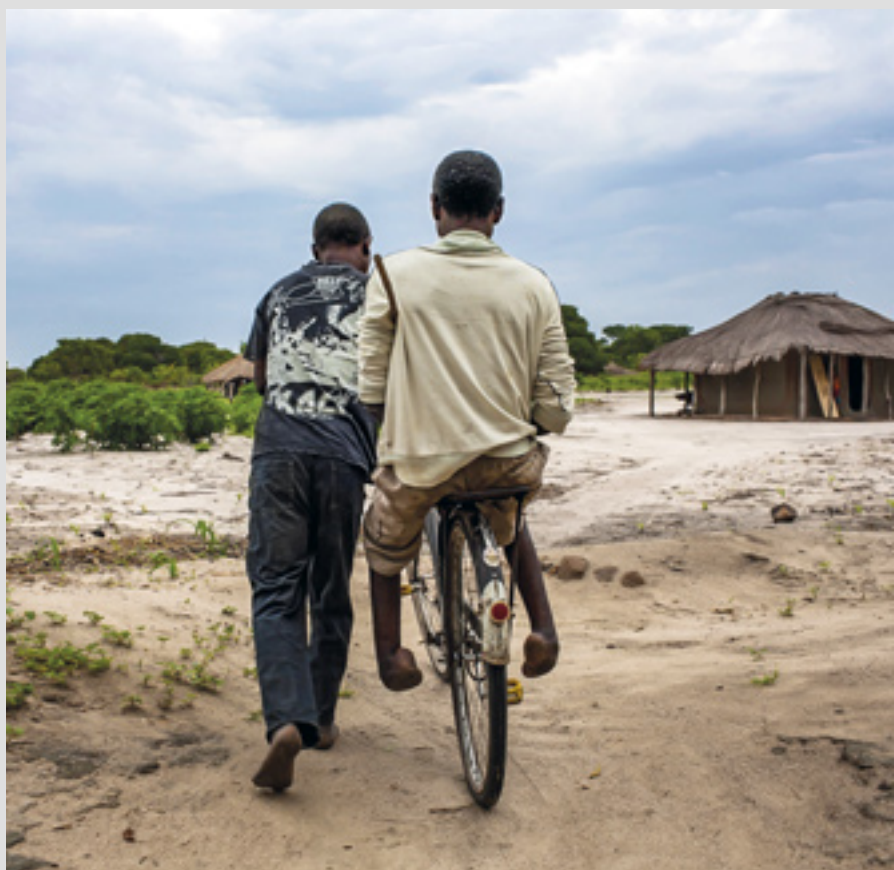
▲ In Mozambique, the Order works with leprosy victims, providing specialist care and training

Segou, Sikasso and Mopti and Bamako district, as well as a specialised centre for children with mental disabilities.