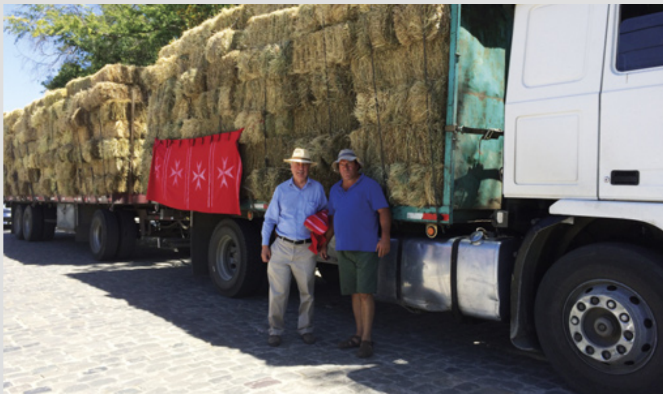
▲ After recent bushfires in Chile, the Order provided essential animal feed

In Loncoche the Shelter Home 'Blessed Karl of Austria' hosts 30 elderly people and provides them with four meals a day. The 'Training Institute Auxilio Maltés', established in