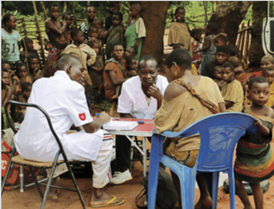
▲ A mobile clinic in northern Congo brings care to local communities and indigenous peoples