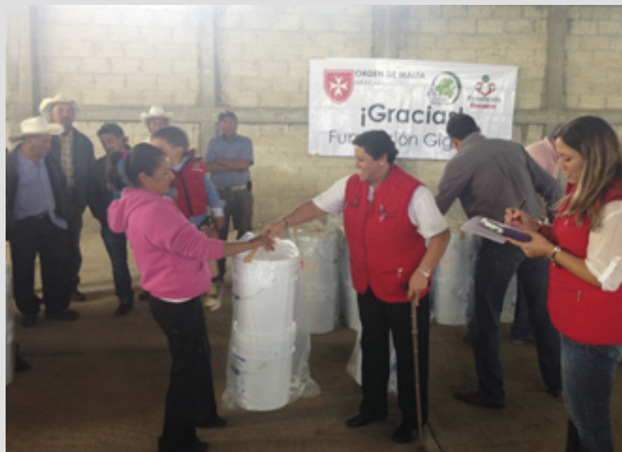
▲ Distributing water filtration equipment after natural disasters

In January 2017, parts of Peru were battered by almost unceasing rains with consequent floods, landslides, loss of life and more than 100,000 people losing their homes. Over half a million were affected by the storms and the resulting damage, over a number of months. In response, staff from Malteser Peru, and Order volunteers, provided food, water, and clothing to victims in Ate in April 2017, and to victims in Piura in May.