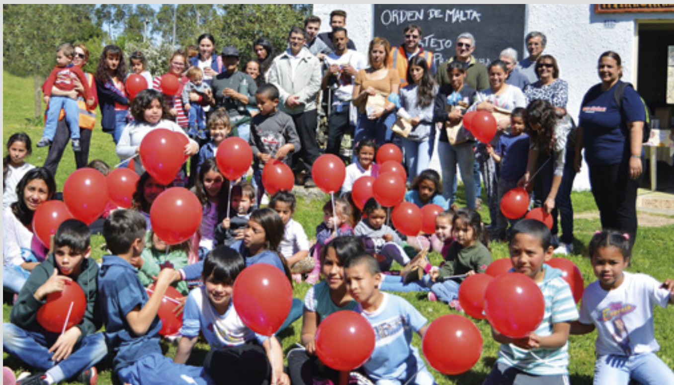
▲ Order volunteers regularly prepare lunches and picnics for poor children in Montevideo, Uruguay

tainer of beds and furniture donated by the Swiss Association); supports the 'Hoga Casita del Señor', a home for elderly, low income women, which was built with a donation from the Association; in Canelones, on the ground floor of the Association's new premises, a residential hospice, 'Hogar Monseñor Jacinto Vera', shelters 35 young mothers and their children; a night and day shelter, 'Hogar La Milagrosa' houses 30 people each night and 30 each day. The Association also provides dental prevention and therapy to a school of 220 pupils, in Junta Local. Education initiatives: courses of catechism and arithmetic for the children living in one of the Montevideo homes; a computer training centre established in the Association's premises in Canelones. The 'Cocina Solidaria 2017' fed 70 poor children in the Fortaleza Barrio, Montevideo, over the cold season, with members and volunteers providing 1,000 lunches and 3,000 'empanadas' (pasties).