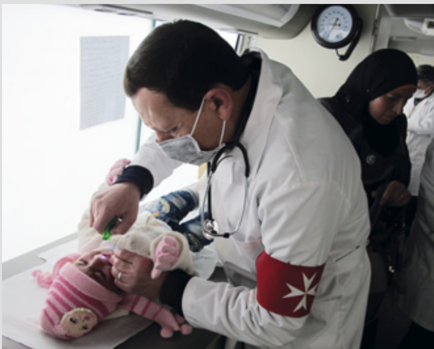
▲ A small Syrian refugee is attended to in the Order's mobile medical clinic in north Lebanon

With the liberation of Mosul in 2017, its citizens began to return gradually, but the situation is precarious, both medically and socially. Malteser International has distributed relief goods and is gradually rebuilding healthcare capacities and offering psychosocial support to the traumatised. They will intensify their work in training and income generation and have launched 'Cash for Work' programmes, with many women participating in courses promoting good hygiene, becoming teachers and helping their communities to respect practices that can prevent epidemics.