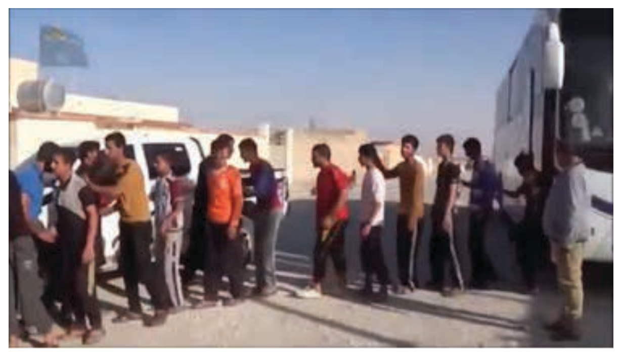
Hundreds of Yazidis arriving in buses to ISIL controlled bases after being forced to convert to Islam.<sup>43</sup>

Following the attack on Sinjar, ISIL developed an ideology on the Yazidis and revealed it to the world. Various written guidelines, booklets and newsletters boasting about, and seeking to religiously ground and legitimise the captivity and enslavement of women, girls and children, as well as the execution of Yazidi men, were released. In parallel, online media channels celebrated the conversion of hundreds of Yazidis to Islam and shared footage of "receptions" welcoming the arrival of buses carrying the newly-converted Muslims into ISIL held territories. 42