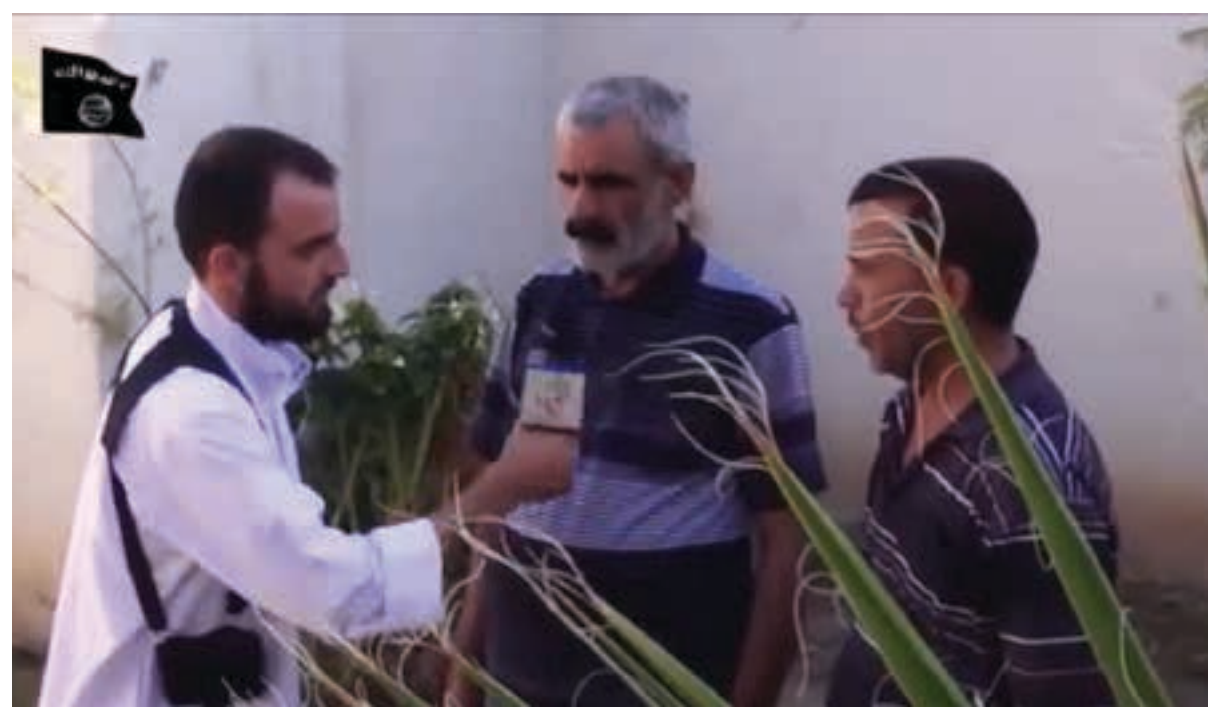
An ISIL member interviewing Yazidis after converting to Islam about how they feel, and what would they like to say to other Yazidis including those stranded on Mount Sinjar.<sup>44</sup>

These publications and broadcasts were intended to be public and have a wide reach and were therefore posted on several online websites. Yazidi activists, journalists and other NGOs including the Kinyat Organization, managed to obtain copies of some of the texts, which are presented and analysed in this report.