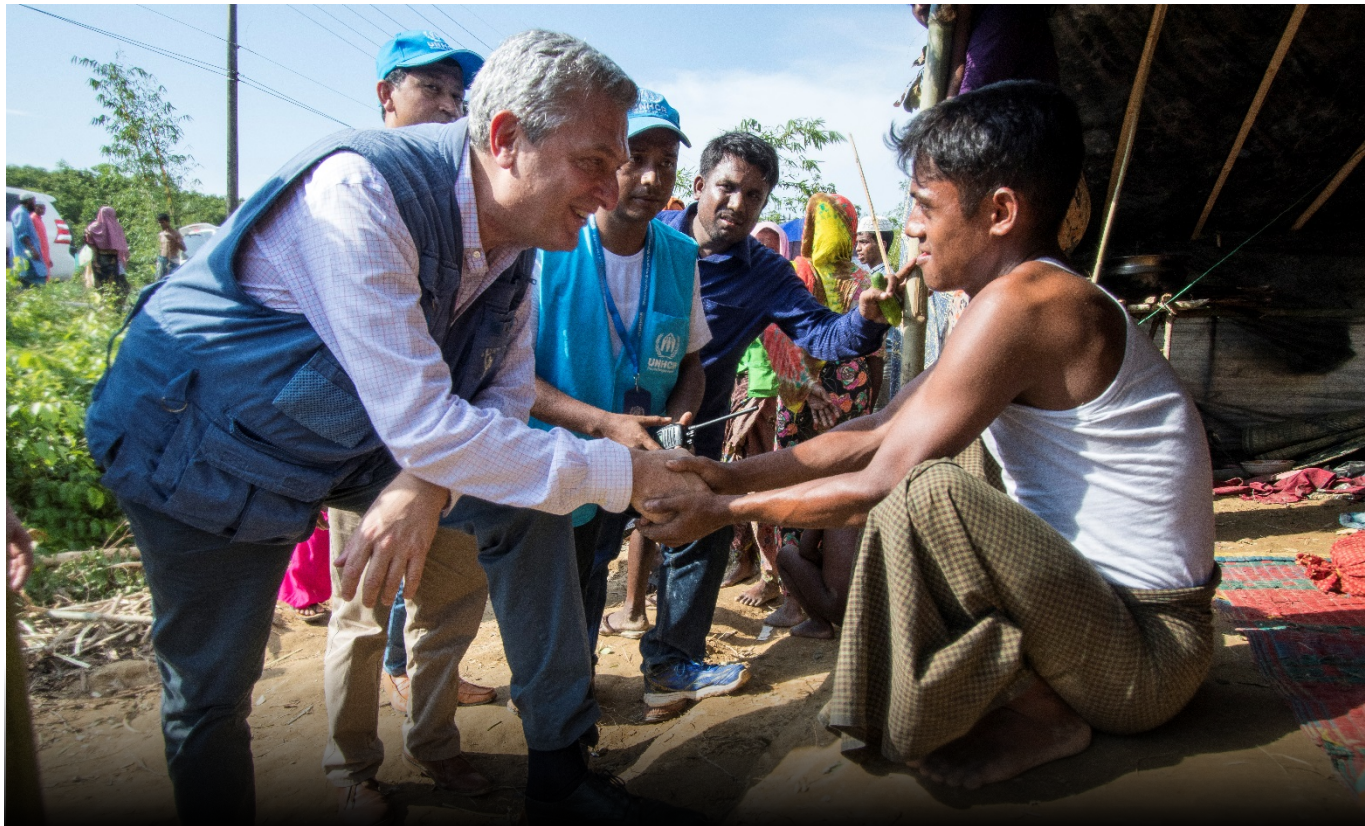
High Commissioner Filippo Grandi talks to a young Rohingya man at Kutupalong camp in Cox's Bazar, Bangladesh, in the wake of a mass exodus of refugees from neighbouring Myanmar.