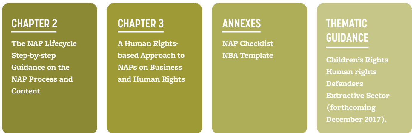
DIAGRAM 1: STRUCTURE OF THE NAPs TOOLKIT