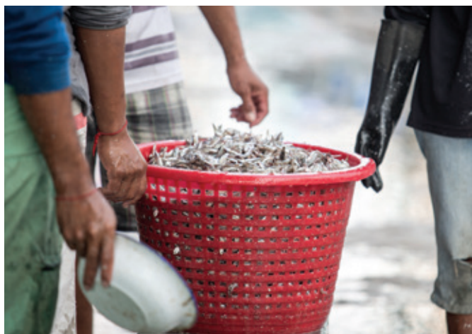
Weighing catch in port, Thailand.

For traceability to work, it is crucial that some key data elements (KDEs) on fishing vessels from various data sources are recorded accurately and in a digital form (with allowances made for small-scale fisheries, such as recording data on landing by artisanal vessels). These should then be preserved and available at all stages of the supply chain so that inspecting officials, investigators, suppliers, retailers, and indeed consumers can identify potential discrepancies or detect fraud. The location of catch is an example of a KDE, and VMS tracking is a data source that can be used to verify it. Alongside KDEs and data sources focused on fisheries, the inclusion of worker-related data can also support efforts to combat human trafficking and other serious abuses on fishing vessels.