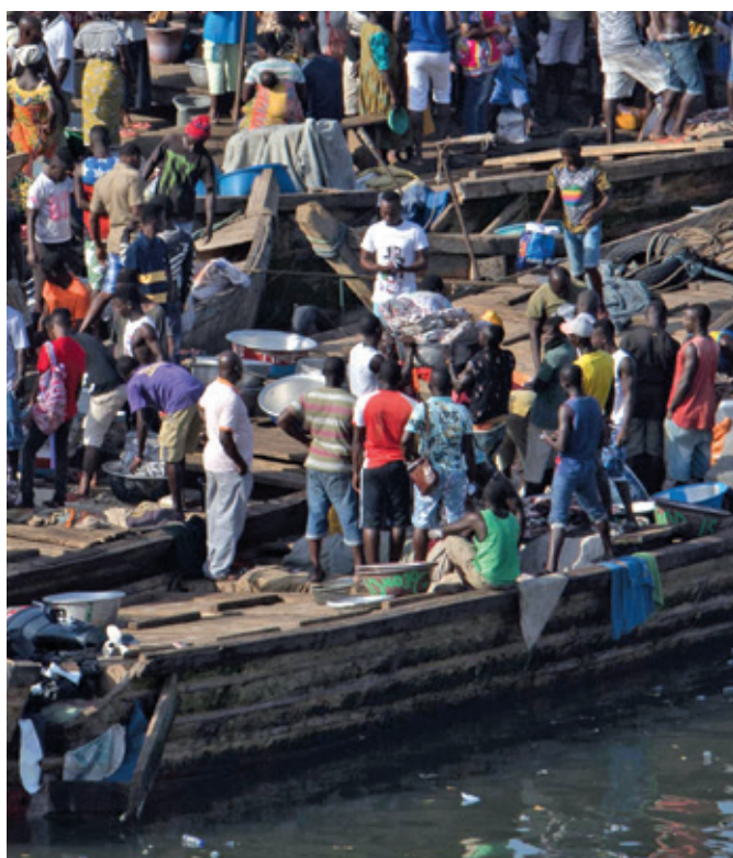
Despite being illegal, a low risk of arrest and sanction has meant that saiko landings have taken place in full view of authorities.

Finally, as saiko catches are not recorded in national catch statistics, fisheries managers are unable to calculate the additional pressure on Ghana’s fish stocks, making effective fisheries management practically impossible 87 .