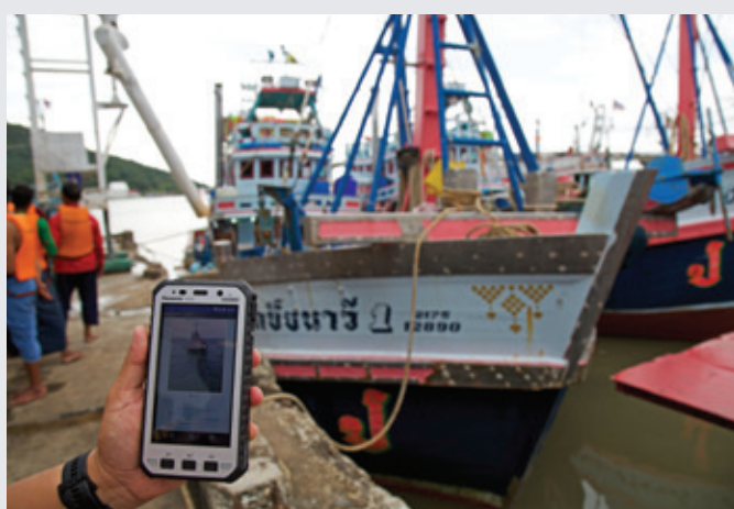
Thai inspection officials can enter a vessel's nine digit UVI number into an app or scan its QR code to receive detailed information about that particular vessel.

The vast majority of Thailand's fishing fleet is smaller than the industrial vessels that normally obtain IMO numbers. Most are also constructed from wood. To tackle the country's high levels of IUU fishing, there is still a need to monitor the identity of these vessels. To do this, Thailand recently implemented a UVI scheme for all its domestic commercial fishing vessels weighing 10 GT and above, encompassing just over 11,000 vessels. Thailand's UVI scheme uses a unique nine-digit number assigned to every vessel registered with the Thai Marine Department.