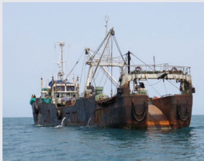
Neptunus , previously named Kum Woong 101 , moored off Banana Island in Sierra Leone.

In September 2013, EJF identified the Korean-flagged fishing vessel Kum Woong 101 fishing illegally in the inshore exclusion zone of Sierra Leone. The vessel then travelled north to a position approximately 90 nautical miles north-west of Conakry, Guinea, to trans-ship with the Dutch-flagged refrigerated cargo vessel Holland Klipper . This trans-shipment was carried out in breach of both EU law, which does not allow trans-shippments at sea unless under the auspices of an RFMO 92 , and Guinean laws which ban trans-shippments at sea 93 entirely. On 1 May 2014, authorities in the Republic of Korea sanctioned a total of