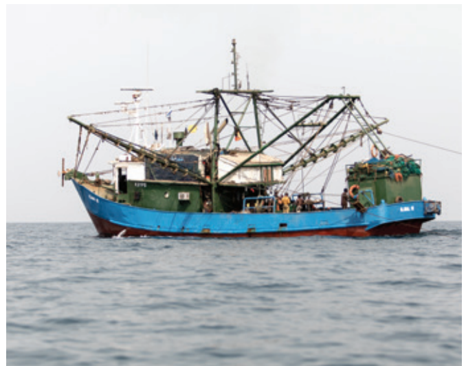
Fishing vessel documented operating illegally in the Sierra Leonean inshore exclusion zone.

Mandatory use of AIS, or any other publicly available tracking device, for fishing vessels, would be instrumental in increasing transparency and making it much more difficult for illegal operators to remain unaccountable, especially if used in combination with IMO numbers. The easily accessible information would be key in assisting control authorities to determine the legality of vessels’ activities or help reassure seafood buyers of the origin of their products.