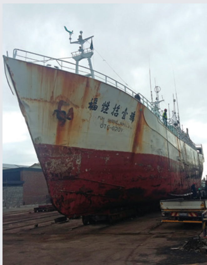
The Fuh Sheng 11 under repair in Cape Town.

The detention of Fuh Sheng 11 demonstrates the connections among vessel safety, labour issues and illegal fishing and how increased port state control and harmonised inspection standards under the UN umbrella can help detect IUU and other related crimes.