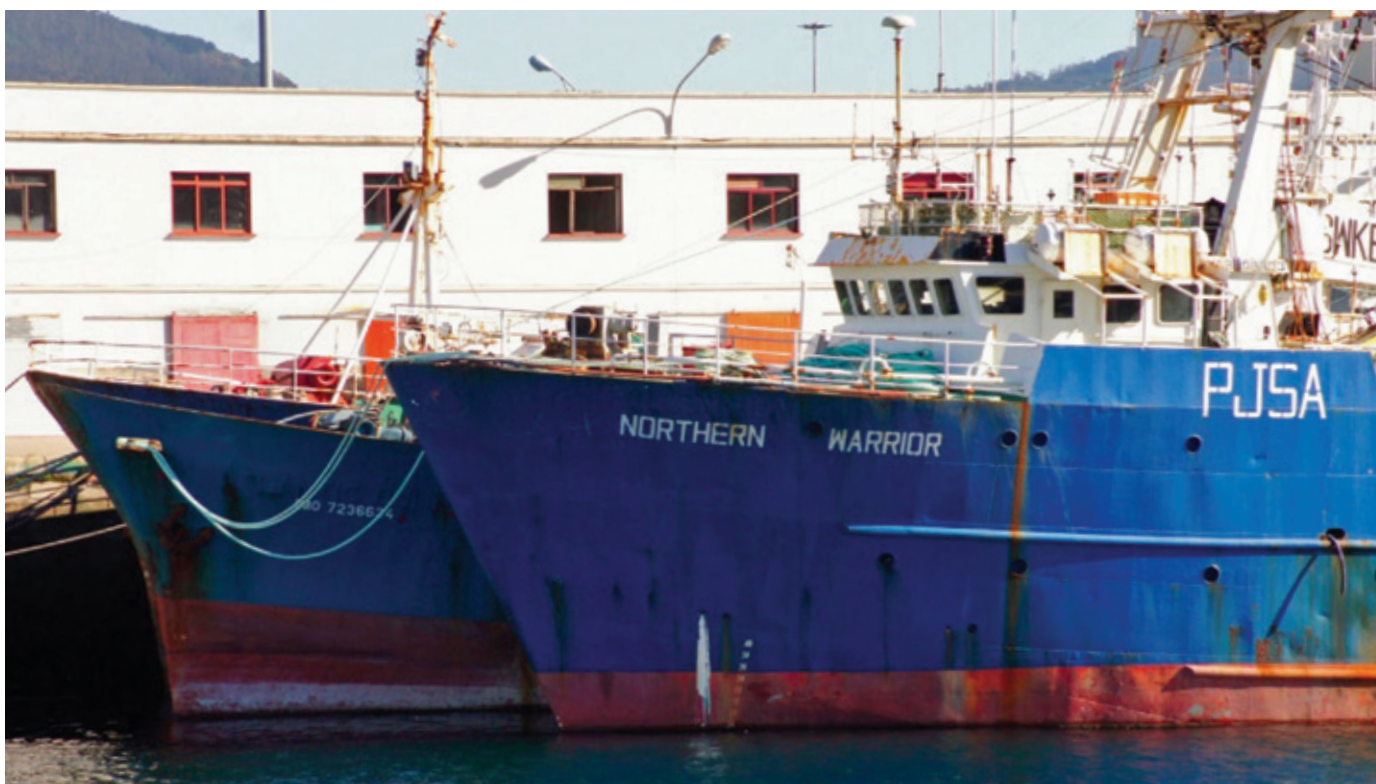
The Northern Warrior detained in Vigo for IUU charges. The vessel was found to have used forged documentation to access the port of Vigo and to obtain fishing authorisations.

EJF recommends that states make the necessary modifications to their legal frameworks, taking into account their national context, to assist in securing successful prosecutions of nationals engaged in a broad range of IUU fishing activities, including through beneficial interests and trade in illegally sourced products.