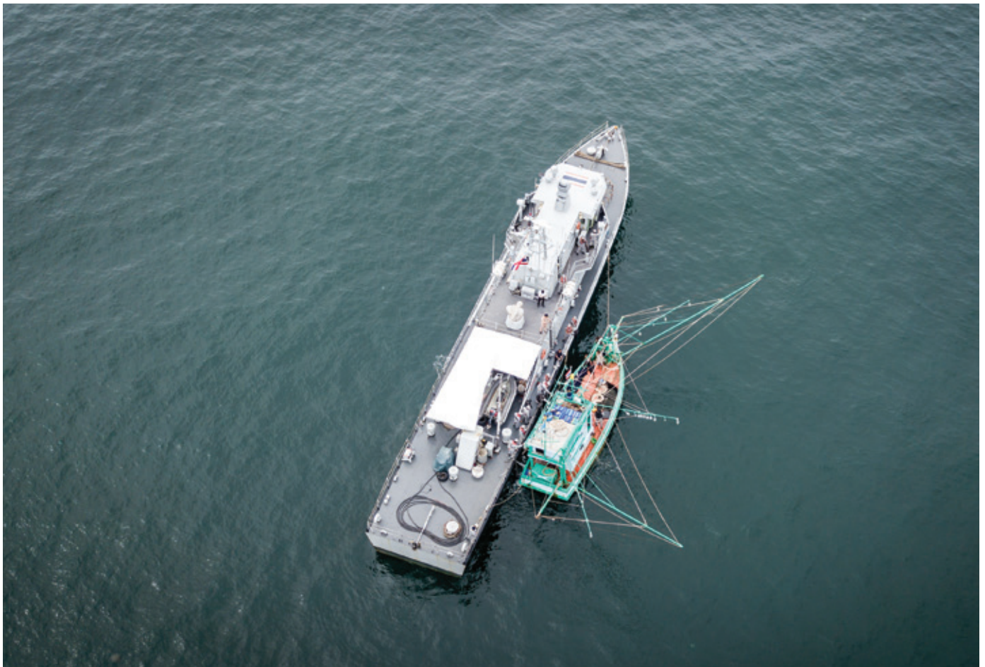
Fishing vessel inspection at sea by Thai naval forces.