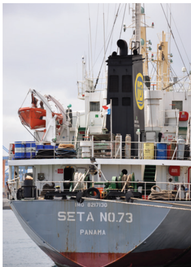
In March 2011, EJF documented an illegal trans-shipment carried out by the Panama-flagged fish carrier Seta 73 . After paying a fine of US$200,000, the vessel changed its flag temporarily to Togo, under the name Inesa . The vessel then changed its name to Sea Rider and re-registered in Panama in 2014. Both Panama and Togo are considered as FoCs by ITF. Since 2016, Sea Rider 's flag is undetermined.