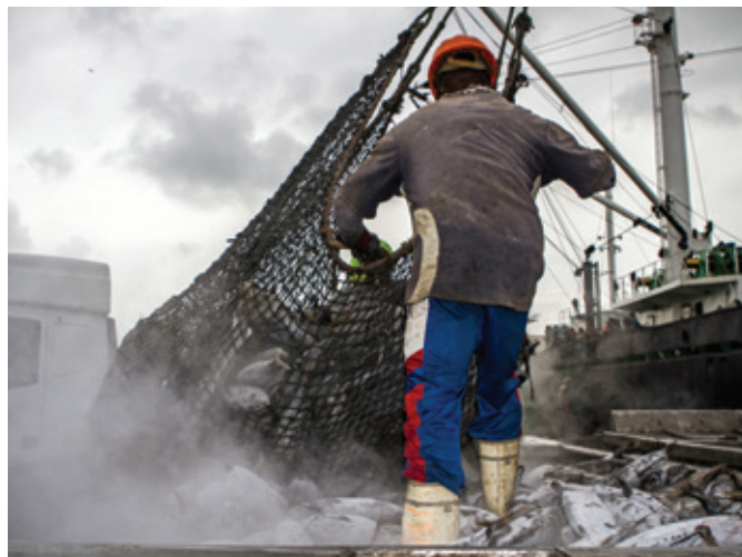
Tuna being unloaded in the port of Abidjan, Côte d'Ivoire.

Countries that are working to close seafood markets to IUU products could greatly benefit from the digitisation of such data to cross-check information where there are doubts about the legality of vessel activities. Legality can be established by looking backwards into the supply chain by trying to determine whether products have been harvested in accordance to national, regional or international rules and if there is a robust chain of custody 97 .