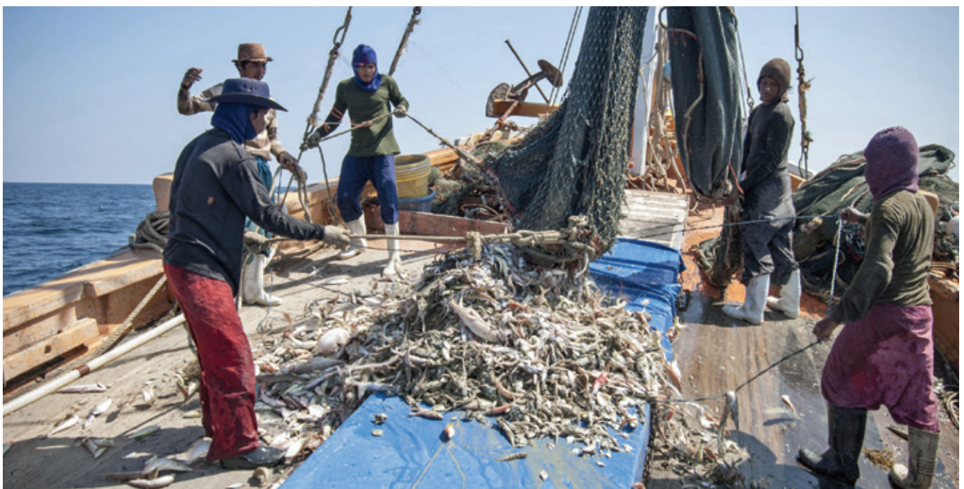
Crew members emptying nets on board a Thai fishing vessel.

Together with the FAO, the IMO and the International Labour Organization (ILO) have acknowledged the links between IUU fishing and crimes involving the safety and welfare of crew 102 , and the complementary nature of the FAO PSMA with two other instruments that were developed primarily with other focuses in mind: the ILO Work in Fishing Convention C188 (ILO C188), and the IMO Cape Town Agreement. The ILO C188 seeks to raise standards for fishers and prevent serious abuses like human trafficking. The IMO Cape Town Agreement was developed to improve the safety of sea-going fishing vessels, in particular through vessel design, construction and equipment requirements. More detail on the contents and status of each treaty is provided in box 8.