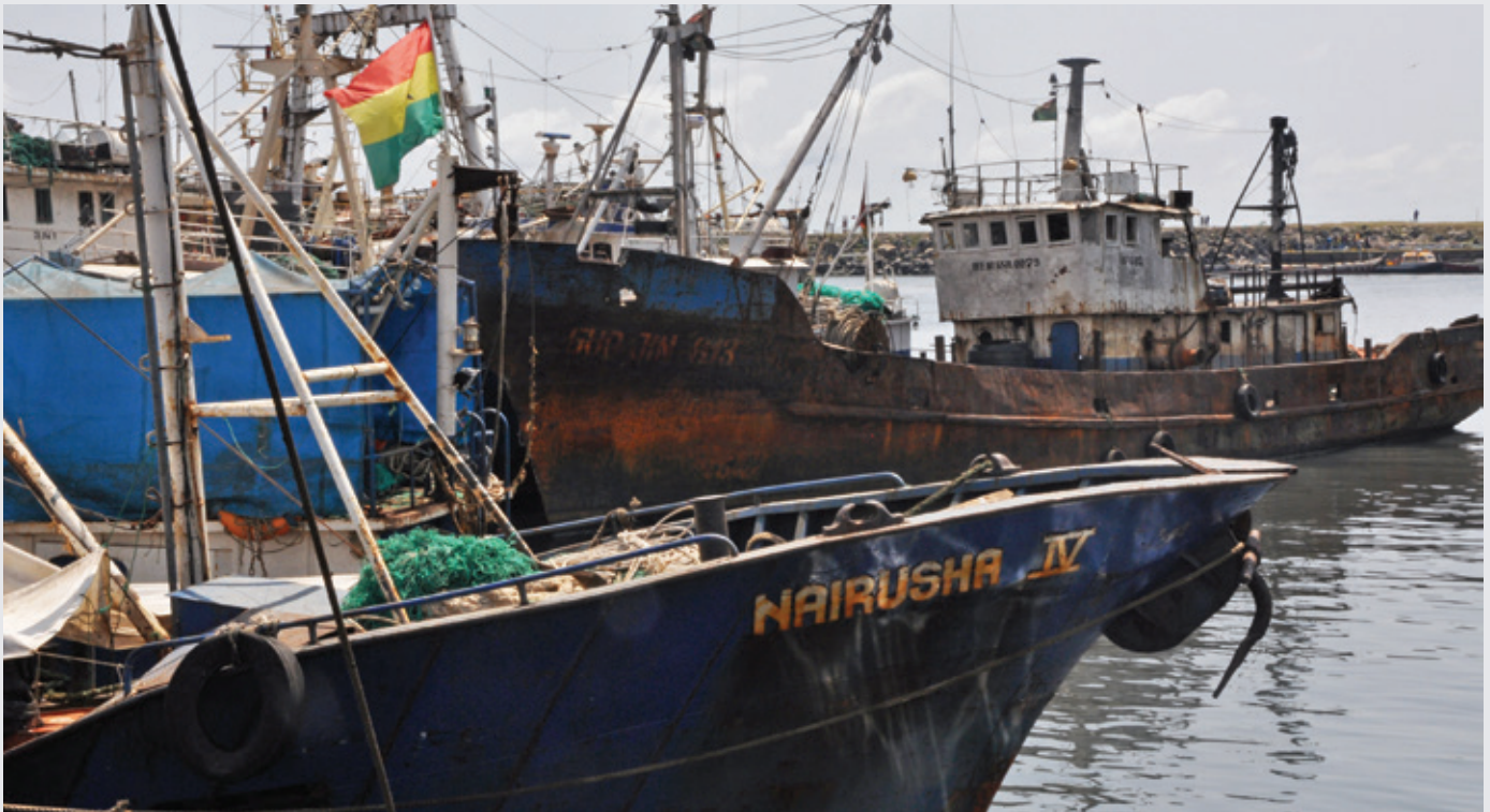
Ghanaian bottom trawlers moored in the port of Tema, Ghana.

According to Ghana's Fisheries Act of 2002, foreign interests are not permitted to engage in Ghana's industrial fishing sector, either directly or by way of joint ventures 74 . This restriction applies to all Ghanaian industrial and semi-industrial vessels, with an exception for tuna vessels. The restriction aims to ensure that the financial benefits accruing from these sectors are retained within the country, thereby contributing to Ghana's socio-economic development, rather than being sent overseas.