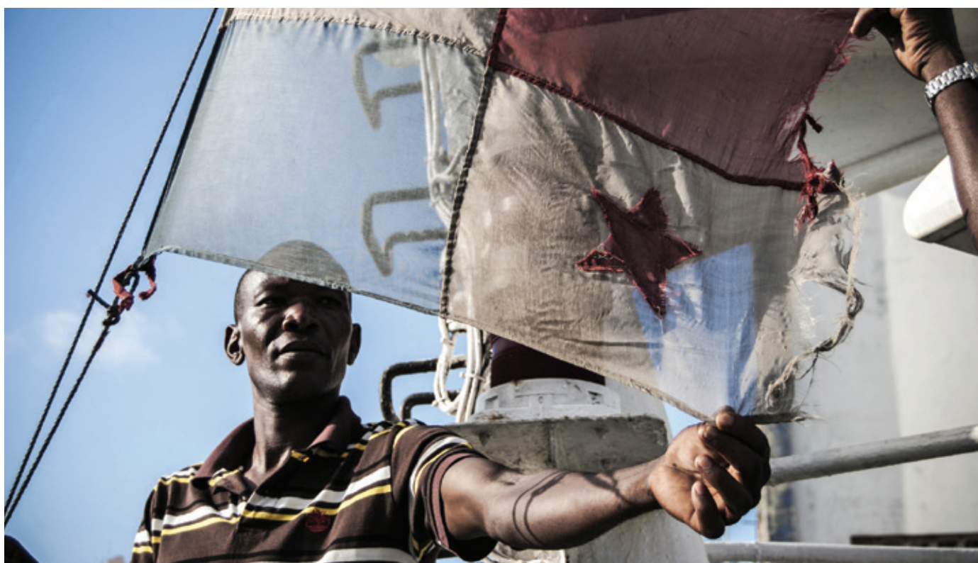
Crew member holding the Panama flag of fishing vessel Isabel.

In some cases, flag states outsource the management of their registries to private companies (known as ‘private flags’). These companies are often located in a different country from the flag state. In some cases, the government administrations in the flag state do not know the identity of the vessels in their registers, making it almost impossible for them to exercise their responsibilities as envisaged by UNCLOS 56 .