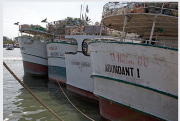
Four of the nine tuna longliners under investigation in the port of Phuket.

In late 2016, nine tuna longliners arrived in the port of Phuket, Thailand, all avowedly flagged to Bolivia but with Taiwanese ownership. After inspection by the Thai authorities, it was discovered that the vessels were using forged documents and were never registered in Bolivia. At the time of writing, following an investigation by EJF and the Royal Thai Government, seven of the nine vessels had been prosecuted in Thailand and an eighth captured in Indonesia 19 . It remains unclear where these vessels are actually registered, leading Thai authorities to classify them as stateless. Through analysing the vessels' former identities and through interviews with former crew, it was found that most of the vessels had changed names two to three times in recent years.