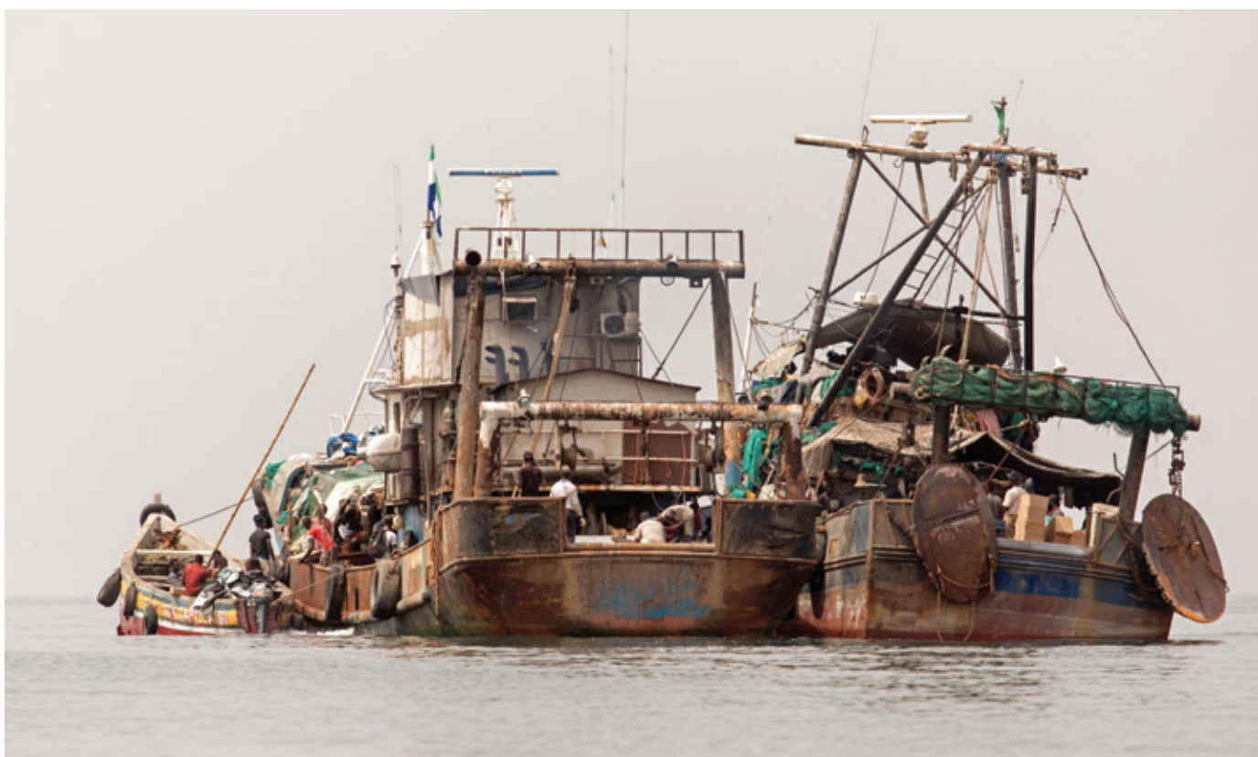
A trans-shipment at sea in Sierra Leone between industrial vessels and an artisanal canoe.

As fishing boats can stay out at sea for longer, away from port inspectors, trans-shipments at sea also facilitate activities associated with illegal fishing, such as human trafficking, forced labour, and other human rights abuses. In 2015, authorities in Papua New Guinea rescued eight workers from a refrigerated cargo vessel who were destined to work on a network of slave boats operating in Indonesian waters 84 . By allowing vessels to effectively stay at sea indefinitely, trafficked crew members can be imprisoned aboard and rotated between vessels for years without any opportunity to go ashore. For business operators and vessel owners who have made considerable investments in the purchase of slave labour from brokers, this system serves as a means to minimise the risk of escape and to prevent captains from selling or transferring trafficked workers between vessels when individual boats return to port for repairs 85 . In 2017, ITF called for a moratorium on high seas trans-shipment by tuna long-line vessels in the Indian Ocean, Gulf of Thailand and South China Sea unless operators implement fair labour standards to protect the seafarers on board these vessels 86 .