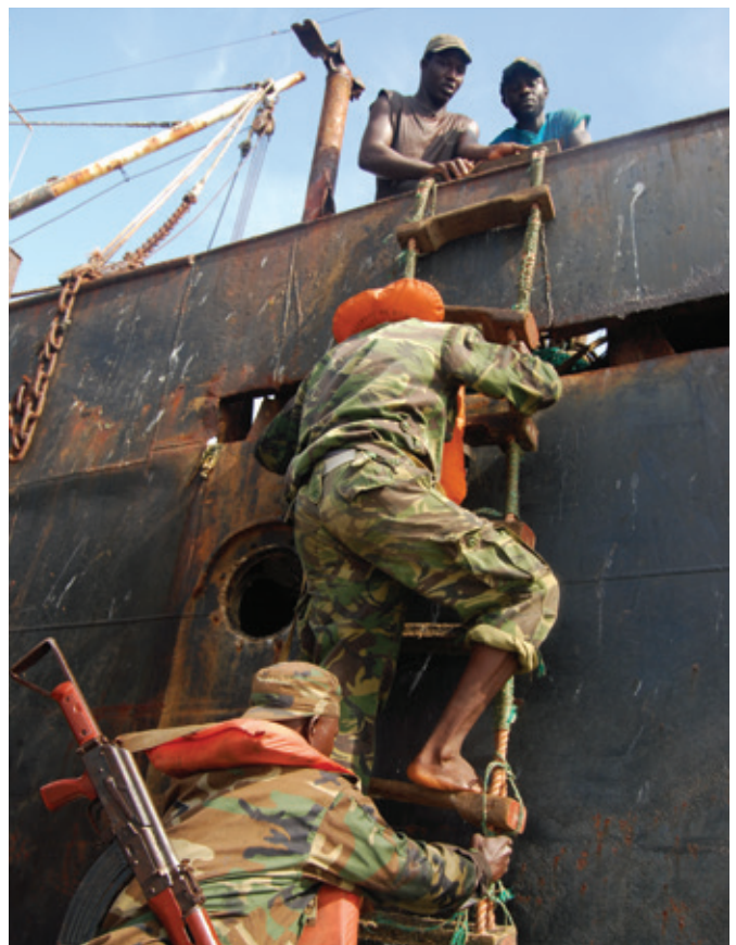
At-sea inspection by Sierra Leonean authorities.