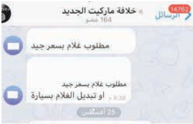
A redacted screenshot from an ISIL online sales group called "The New Caliphate Market", which at the relevant time, consisted of 164 members. The screenshot shows a group member looking to buy a gholam – a term used to refer to enslaved boys, particularly the Yazidis – for a "good price" or in exchange for a car.