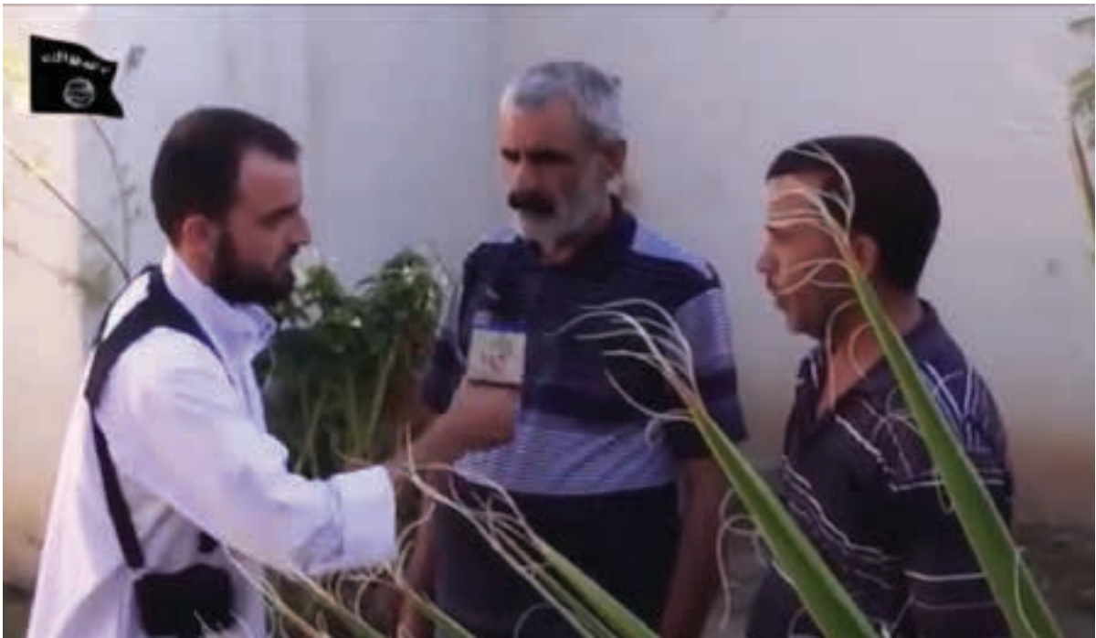
An ISIL member interviewing Yazidis after converting to Islam about how they feel, and what would they like to say to other Yazidis including those stranded on Mount Sinjar. 44

These publications and broadcasts were intended to be public and have a wide reach and were therefore posted on several online websites. Yazidi activists, journalists and other NGOs including the Kinyat Organization, managed to obtain copies of some of the texts, which are presented and analysed in this report.