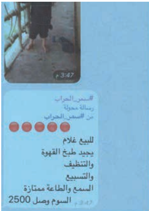
A screenshot from a Telegram selling group where a member posts: "a boy slave for sale. Knows how to make coffee, how to clean., (...), Listens and obeys greatly. The bidding reached $ 2500."

Other ISIL fighters selling Yazidi boys would specify their skills: