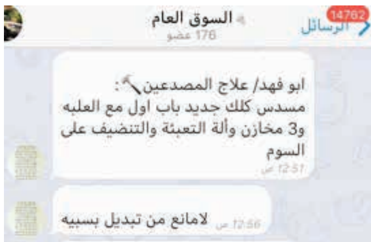
A redacted screenshot from a third group called "The Public Market" with 176 members where a group member is offering his gun for sale (listing all its specifications and condition) and listing the possibility of exchanging it with a sabiyya .