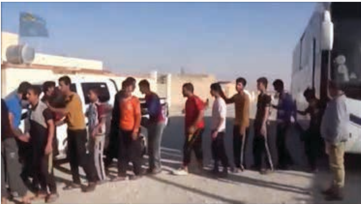
Hundreds of Yazidis arriving in buses to ISIL controlled bases after being forced to convert to Islam. 43

Following the attack on Sinjar, ISIL developed an ideology on the Yazidis and revealed it to the world. Various written guidelines, booklets and newsletters boasting about, and seeking to religiously ground and legitimise the captivity and enslavement of women, girls and children, as well as the execution of Yazidi men, were released. In parallel, online media channels celebrated the conversion of hundreds of Yazidis to Islam and shared footage of “receptions” welcoming the arrival of buses carrying the newly-converted Muslims into ISIL held territories. 42