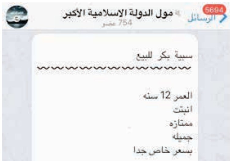
A redacted screenshot from another ISIL online sales group called "The Great Mall of the Islamic State" which, at the relevant time, consisted of 754 members. The screenshot shows a group member offering a "virgin sabiyya " for sale with the following specifications: 12-year-old, pubic hair started to grow (inferred through the common use of the term 'she has grown'), excellent, beautiful, for a special price.