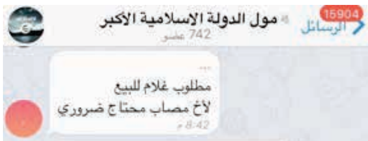
A group member in the online selling group of 'The Great Mall of the Islamic State' writes: "A boy slave (gholam) wanted, for an injured brother. Urgently needed."

Yazidi boys that were separated from their families were also gifted or sold to ISIL fighters. While most of them appear to have been taken to indoctrination and recruitment camps, testimonies and extracts from online conversations collected by the Kinyat Organization and reviewed by the FIDH delegation show that boys had been kept by ISIL members and forced to carry out household chores, such as making tea and coffee. The online sale of boys was also observed. In one online marketplace, the following request was made by an interested buyer: