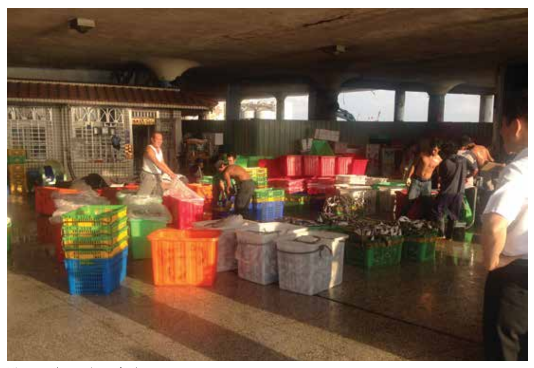
Migrant workers sorting seafood.

Employee turnover, whether local or migrant workers, is something the company monitors as an indicator of employee welfare and satisfaction.