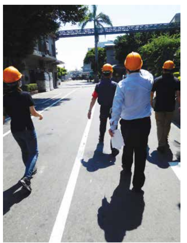
Third-party audit in action in Taiwan.

The methodology that we used to report these emerging best practices has varied greatly from company to company — from witnessing shadow audits to meetings with a company's management team to surveying the appropriate staff at both the company and supplier levels on their ethical recruitment policy implementation. In addition, we sought the expertise of SA8000 auditors to provide feedback on challenges surrounding policy implementation.