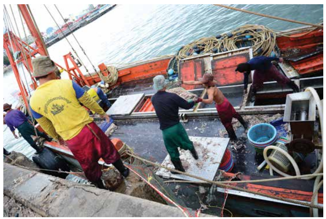
Workers on a seafood vessel in Thailand

ICCR staff and ICCR member Robeco and other investors involved with UN Principles on Responsible Investment's Labor Standards Working Group, engaged the company on the issue requiring full disclosure of the measures it has implemented to address the allegations. The dialogue started in August 2014 to discuss risk management for the company as well as its buyers. In the fall of 2014, ICCR met with company management in Bangkok to discuss recruitment of migrant workers. At that time the company had just started to implement its ethical recruitment policy. CP Foods noted that it has taken measures to improve the traceability of its extended supply chain through a joint effort with the Thai government. The company has adopted a number of additional measures to increase the traceability of its farmed shrimp supply chain as well as to address the issues surrounding the welfare of migrant workers in its supply chain: