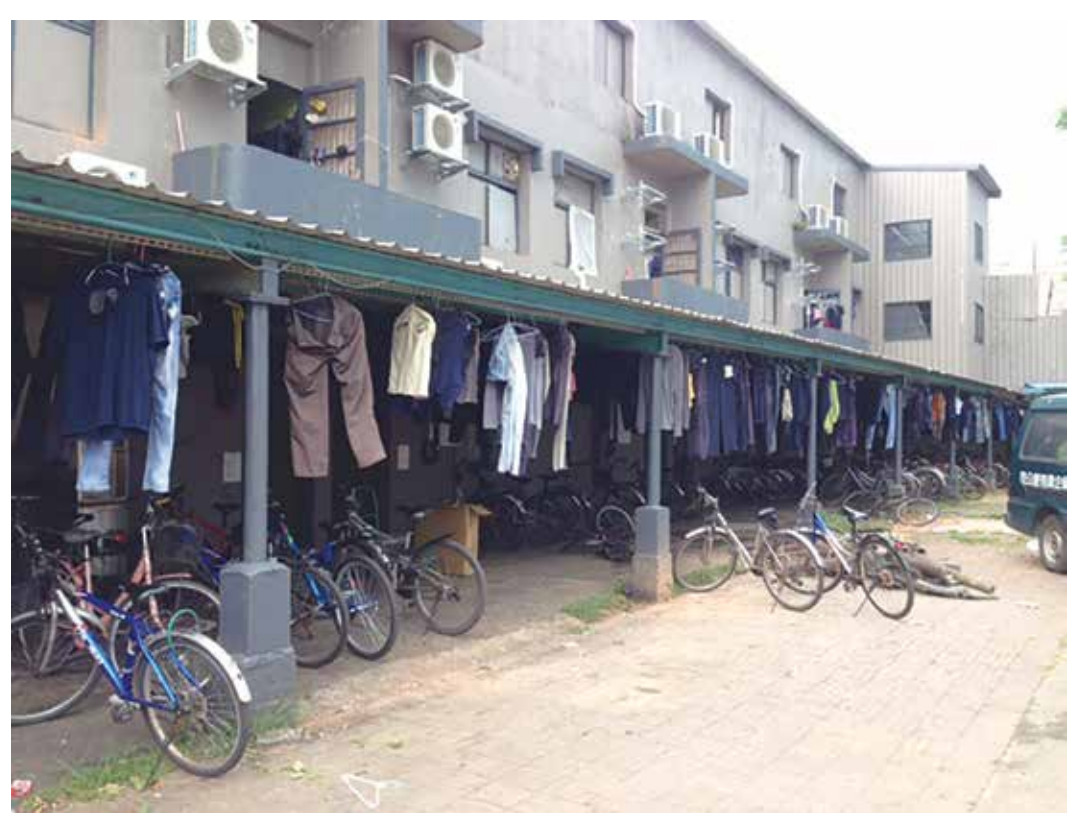
Migrant worker living conditions.

The use of third party labor brokers is a widely accepted practice in the vast majority of countries where companies hire migrant workers. For this reason, in developing its policy a company must determine the level of risk it is willing to assume if and when labor brokers are used. For example, while Patagonia allows its suppliers to use labor brokers as long as they can provide evidence that they are abiding by the company's recruitment requirements, HP decided that labor brokers present too much risk and mandates that all suppliers directly hire its migrant workers. More specifically, while labor brokers can be used for recruitment purposes, once hired, the company must establish a direct contract with the employee. It is difficult to conduct due diligence on labor brokers since there could be many different types of brokers involved in the employment process of a given worker and many of these are located in a different country than the supplier. The company will have to factor these complications into its decision on a policy related to labor brokers. However, due diligence on labor brokers has to be covered by an audit.