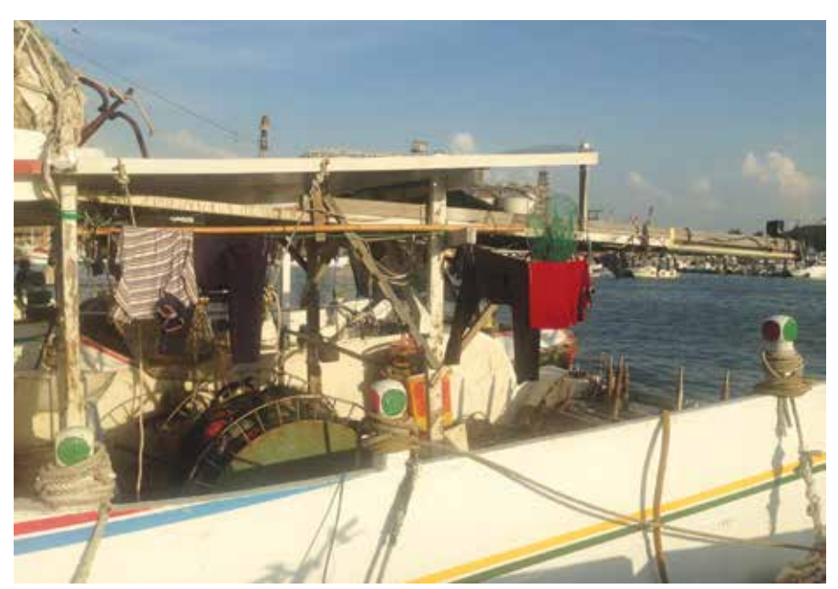
Migrant worker life on a fishing boat.

Thailand has become strongly associated with slavery in seafood supply chains. In response, Thai Union and other industry players joined the Seafood Task Force which promotes a sustainable supply chain in the Thai fishing industry.