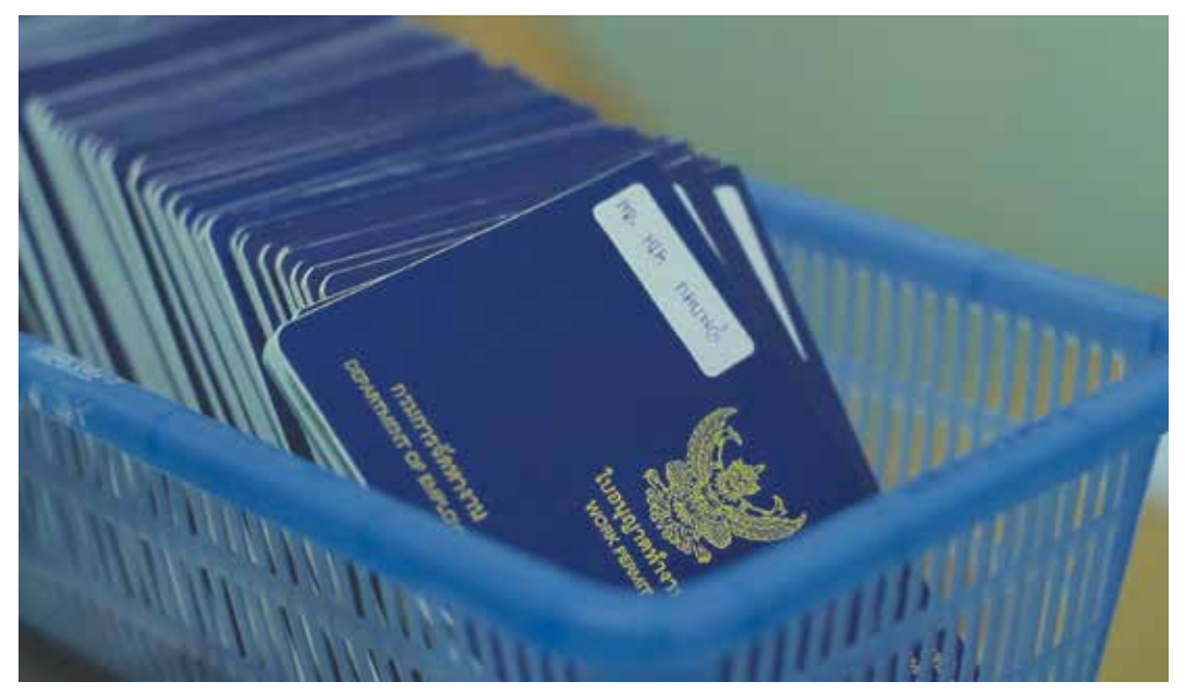
Thai work permits.

Suppliers need to provide a safe, private space, such as lockers, for workers to store their documents in their living spaces.