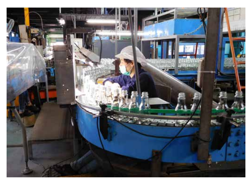
A migrant worker on a production line in a glass-blowing facility in Taiwan.

Many migrant workers experience a large financial burden not just from paying broker fees before departure and while on the job, but also from government-imposed requirements to take loans that secure their return to their home countries. Excessive government-imposed fees create enormous risks for workers: they incentivize illegal migration through unregistered brokers that bypass those government regulations, placing many vulnerable job seekers at risk for human trafficking<sup>17</sup>.