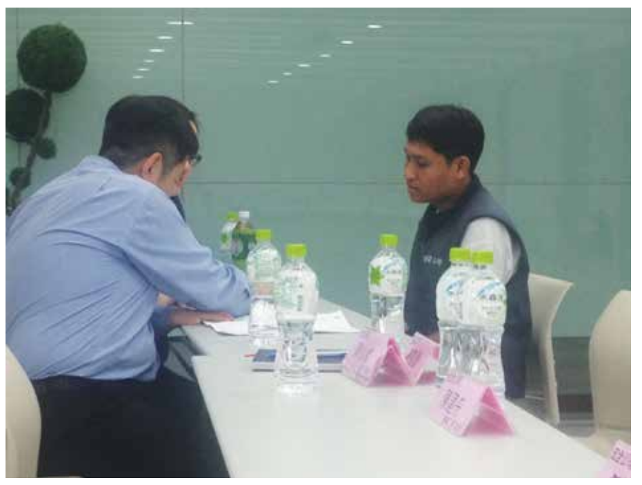
Worker interviews in progress.

Since the actual policy implementation falls on the suppliers, companies are strongly urged to provide their suppliers with as much practical support as possible, including but not limited to in-person training, webinars and, importantly the financial resources required to implement the policy. Patagonia and HP both found it valuable to bring suppliers together for an in-person workshop to share best practices and challenges. TCCC has built supplier support by organizing supplier trainings with peer companies through AIM-PROGRESS in the Middle East, Turkey and Thailand to date. Issues related to forced labor tend to be systemic, and it is important to recognize that a single company will not have the power to change the entire system; collaboration with parties up and down the chain will be critical to achieving goals. Both buyers and suppliers should consider dedicated staff that will be responsible for overseeing specific parts of the process.