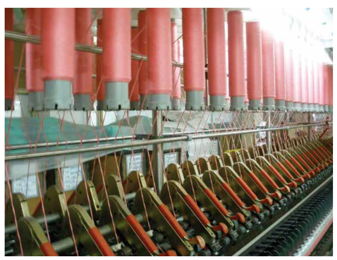
Inside a spinner factory.

PA has implemented strong management systems and clear human resources processes to ensure that all workers are working voluntarily. First, PA only hires workers directly from the area surrounding its factories and does not use any recruiters or labor brokers. Additionally, PA does not pay any recruitment fees or charge workers any fees to receive employment.